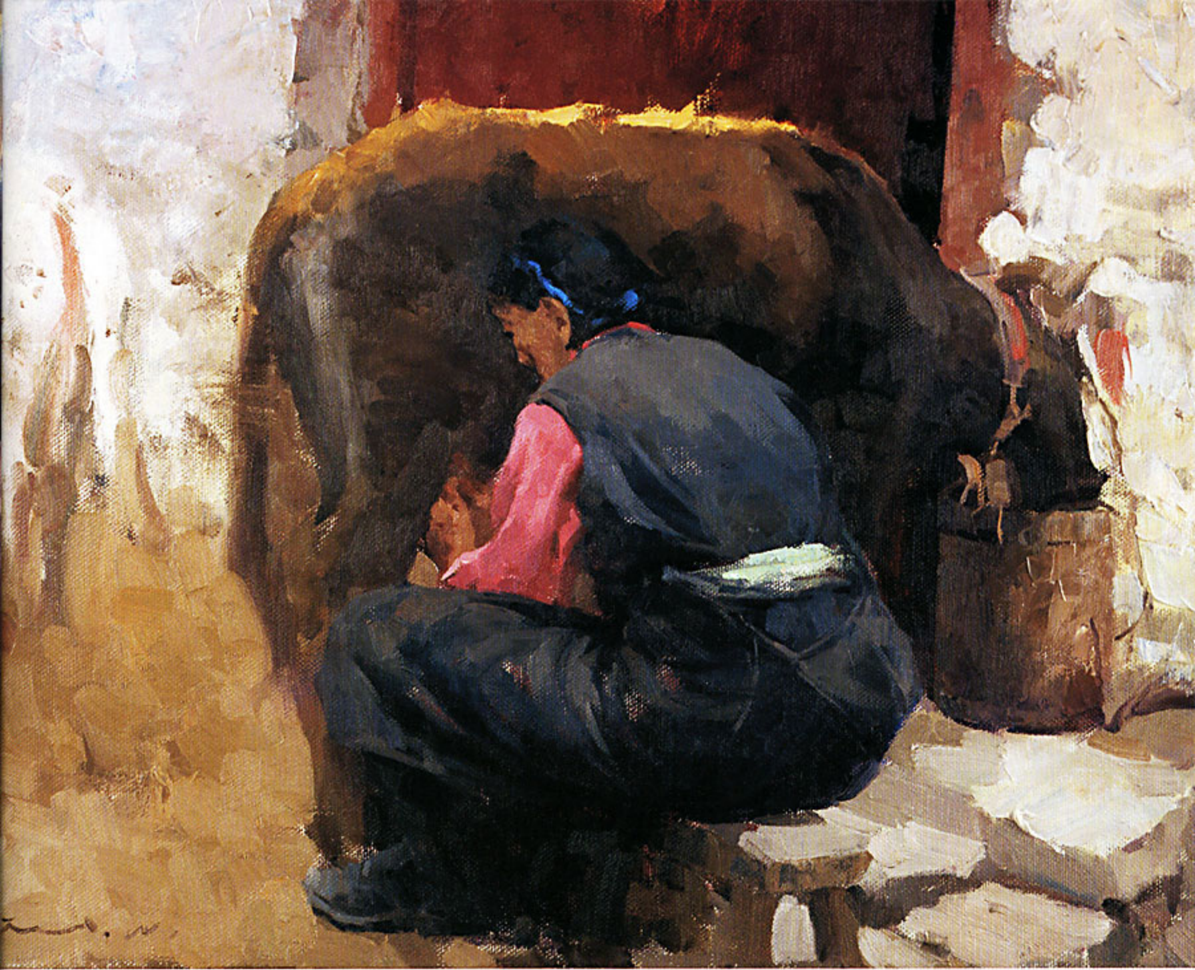
TIBETAN MILK WOMAN, OIL ON CANVAS, 24 X 30"

trying my best to help them to invoke their passion and artistic feeling within themselves. I encourage them to think thoroughly about the design of the composition, color, mood and subject matter before laying any paint to canvas, and to follow their feelings when they start."