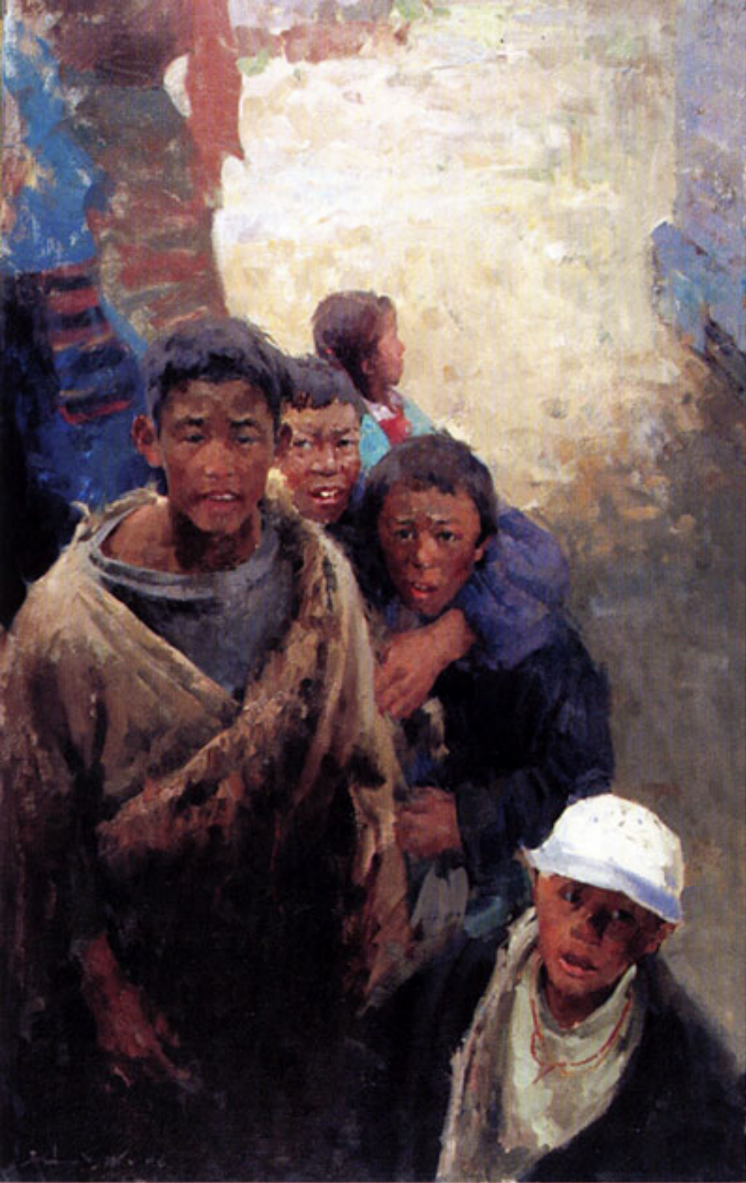
A DAY IN THE LIFE, OIL ON CANVAS, 36 X 24"