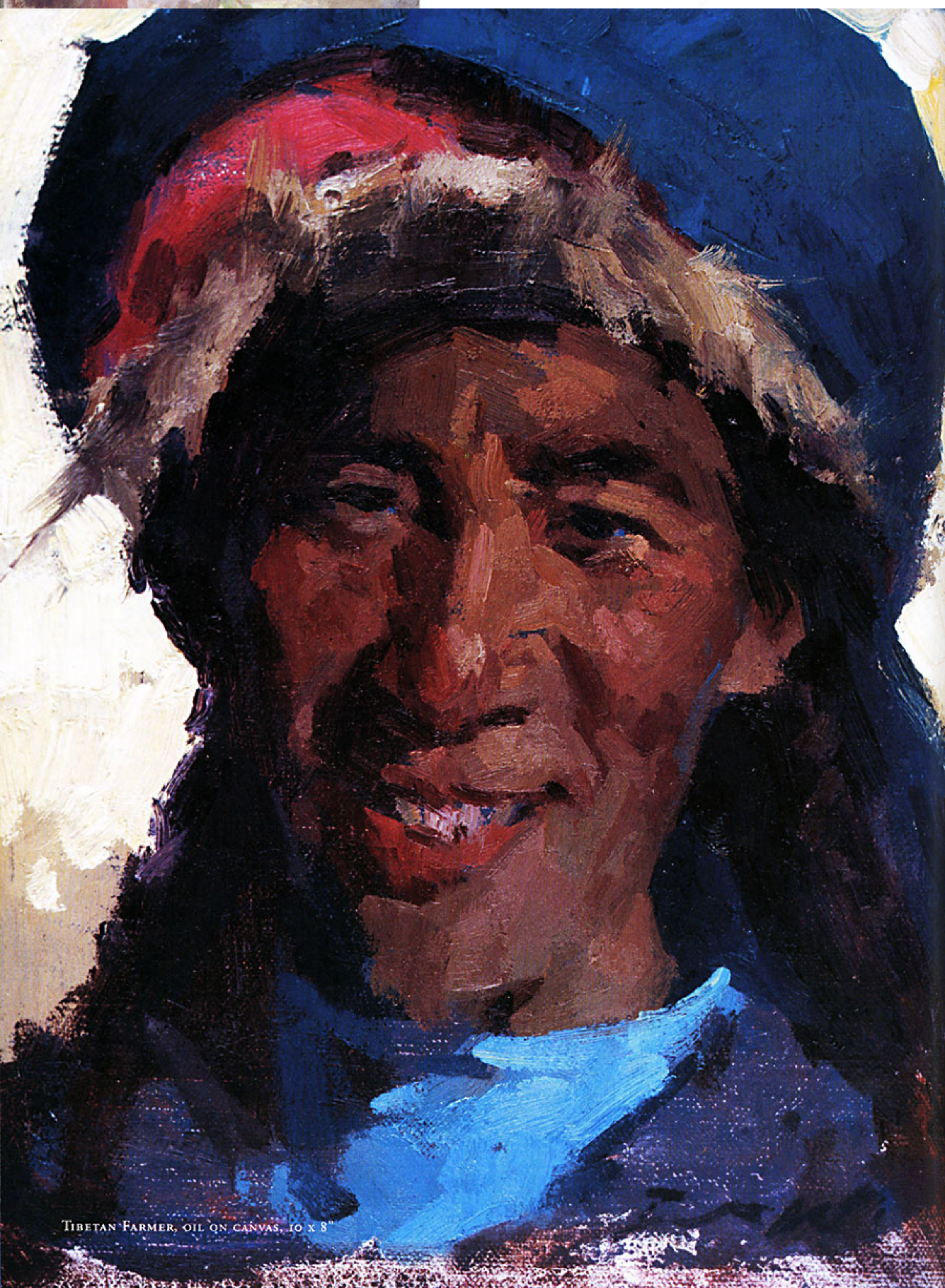
TIBETAN FARMER, OIL ON CANVAS, 10 X 8"