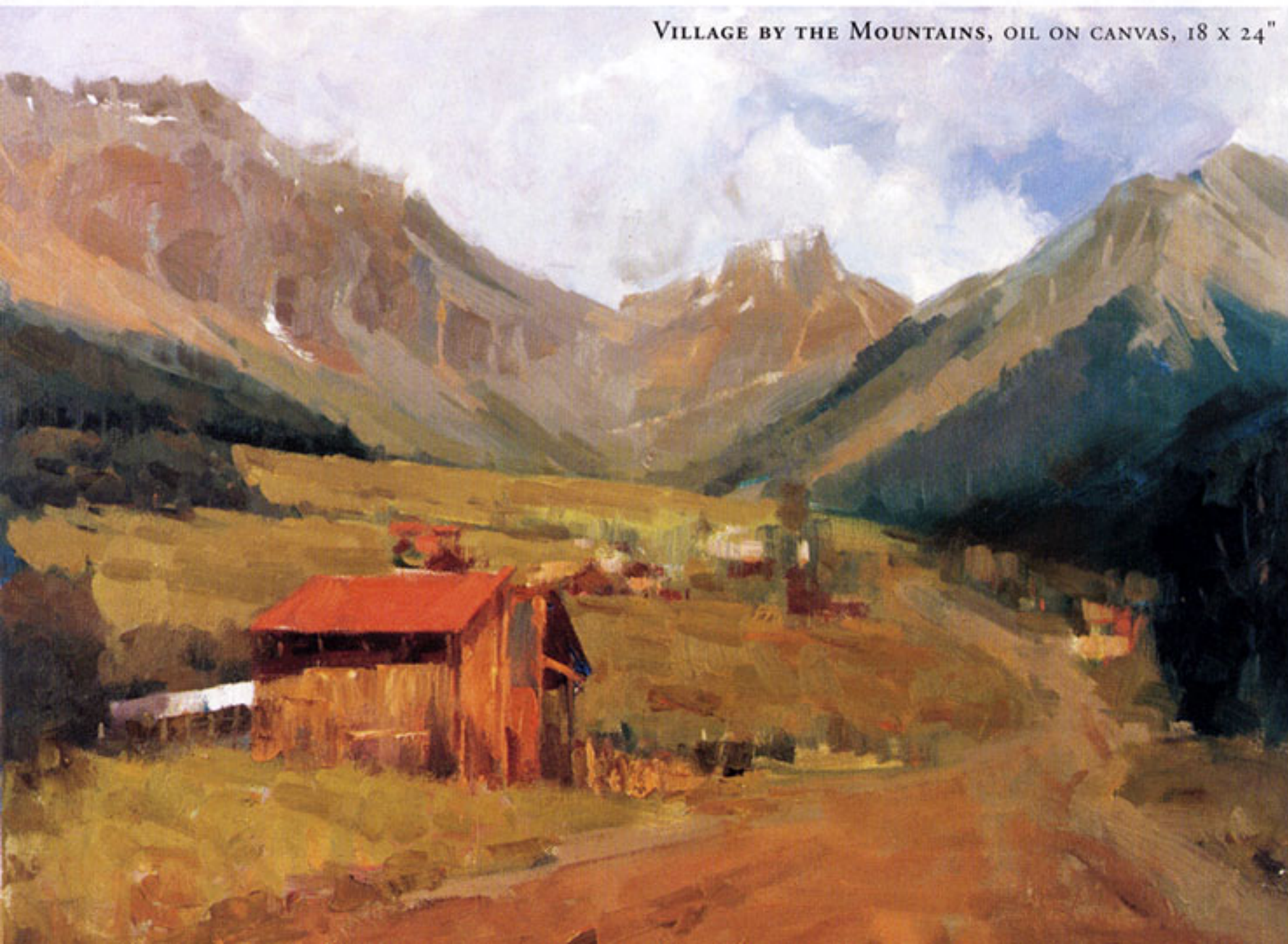
VILLAGE BY THE MOUNTAINS, OIL ON CANVAS, 18 X 24"