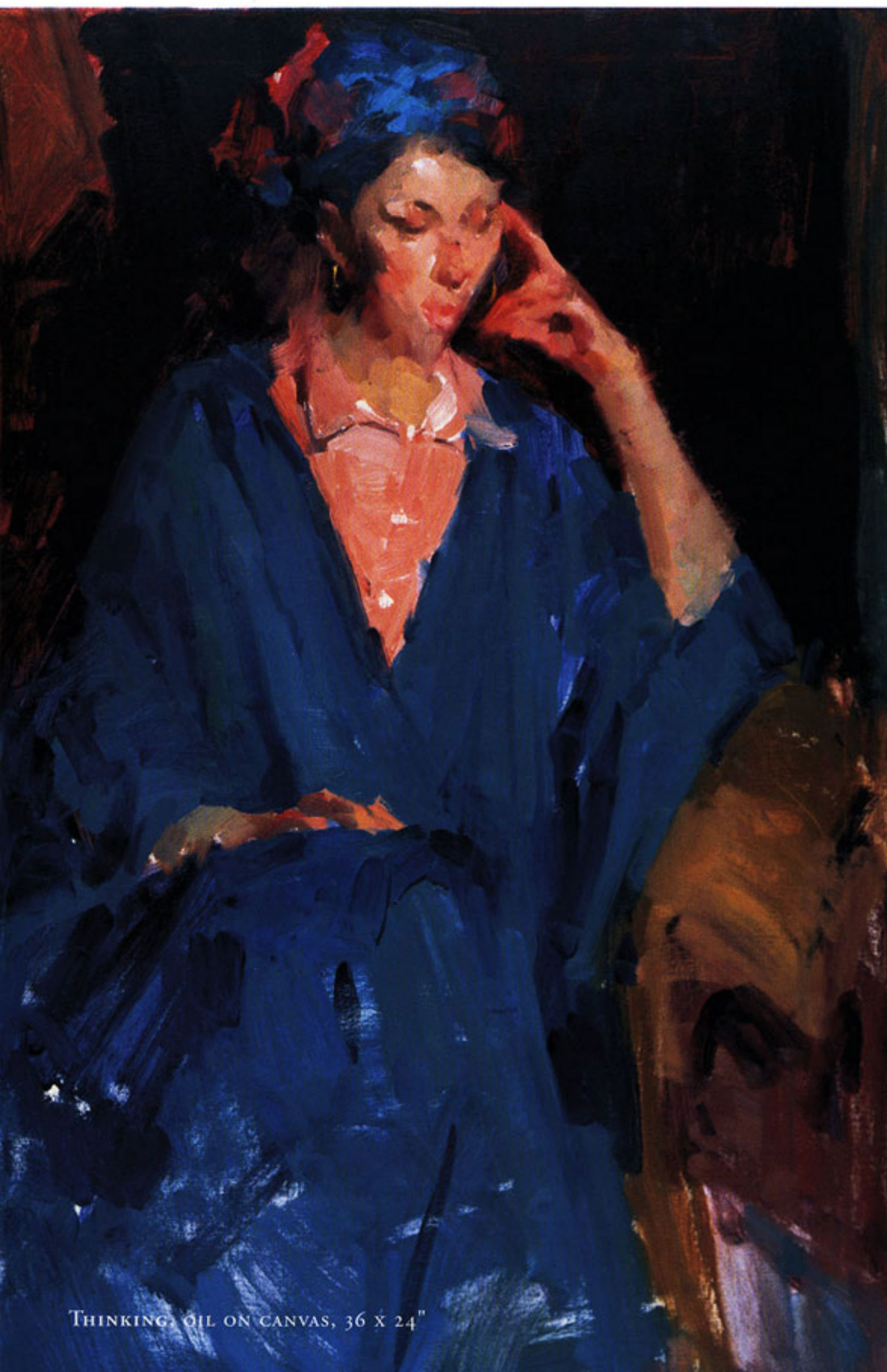
THINKING, OIL ON CANVAS, 36 X 24"

Collectors find beauty and serenity in these depictions of the simple, rural life.