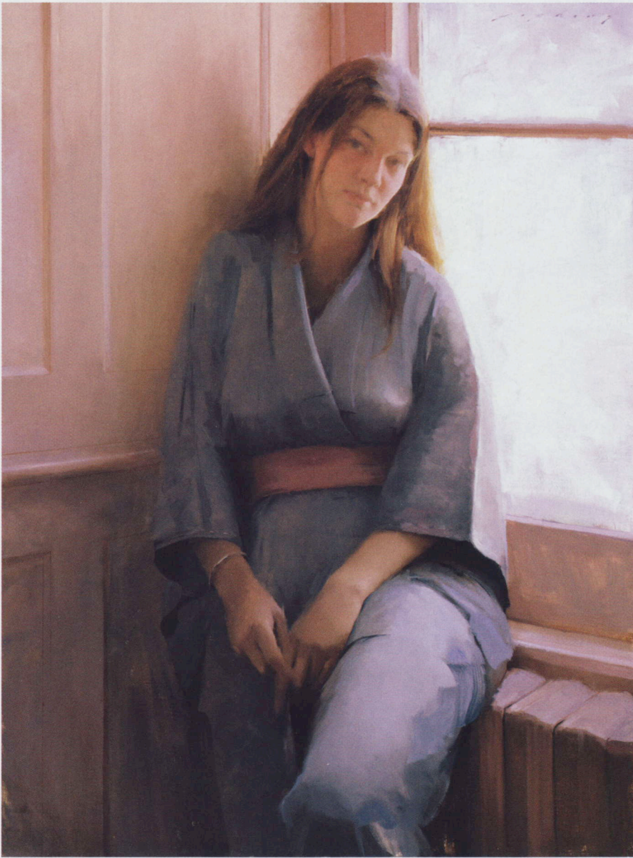
SELENE, OIL ON CANVAS, 40 X 30"