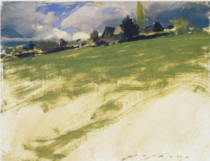
LA ROCHE POSAY, OIL ON CANVAS, 8 X 10"