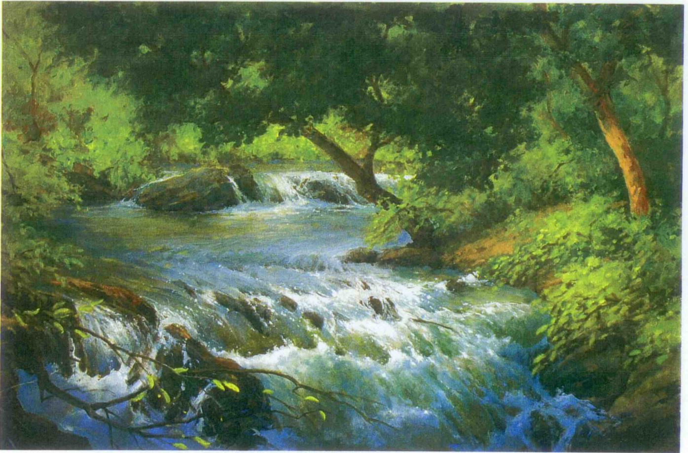
VIC RIESAU, SPRING WATERS, OIL ON CANVAS, 24 X 36"