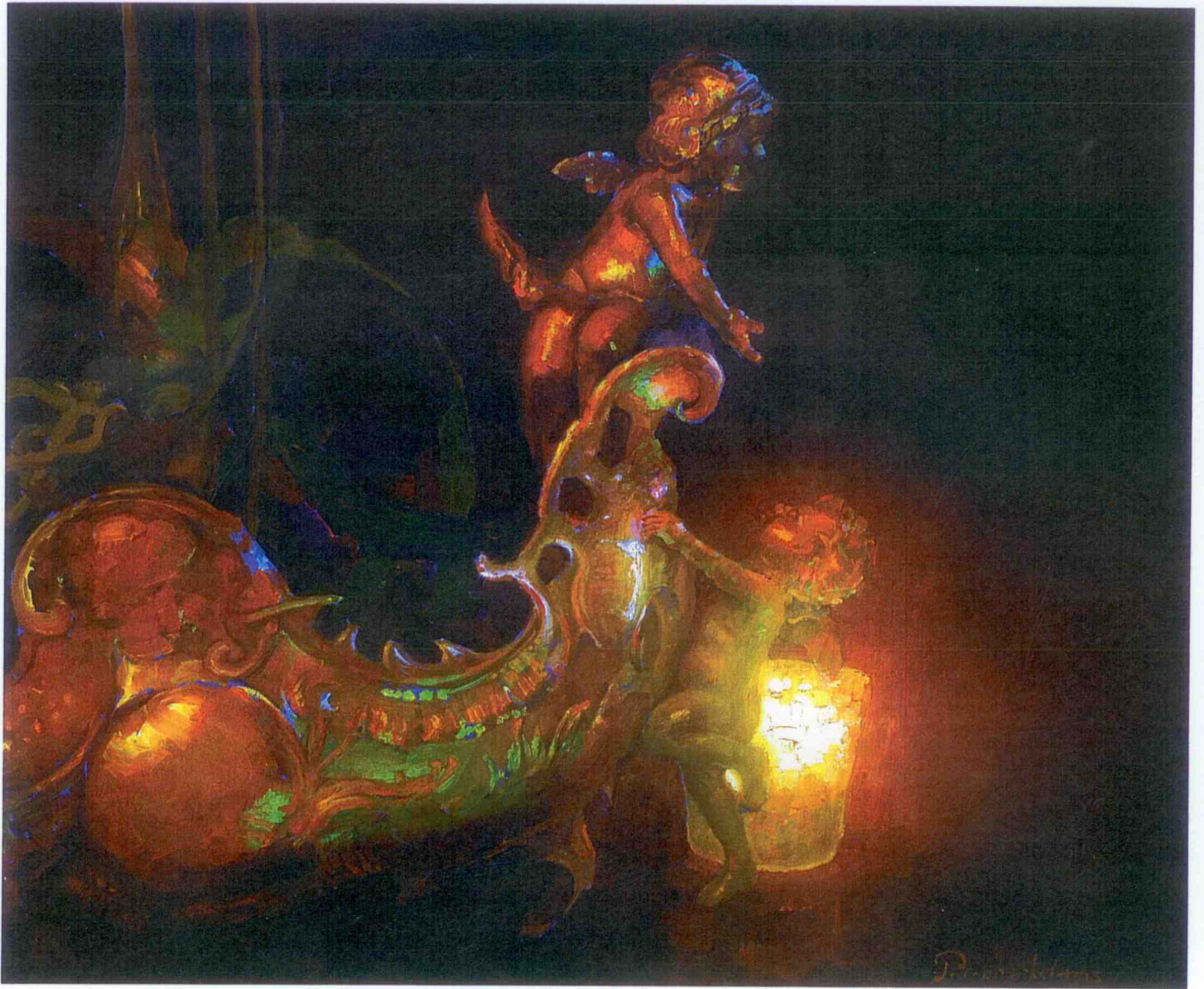
PETER ADAMS, CUPIDS ASCENDING THE SILVER ARK, OIL ON PANEL, 20 X 24"