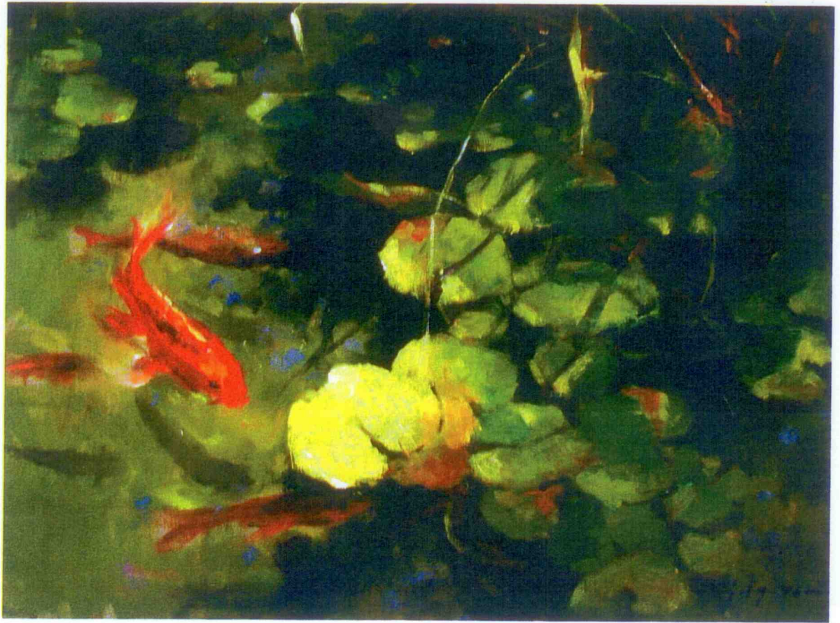
MILLY TSAI, KOI POND, OIL ON LINEN, 18 X 24"