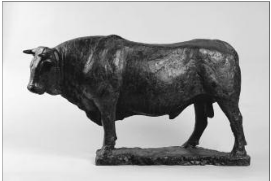
Bull of Bordeaux