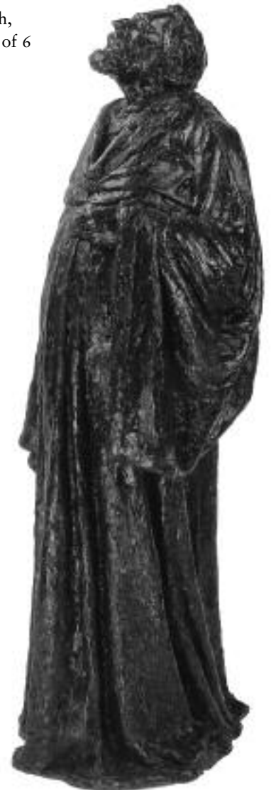
Study of a Robed Figure Bronze 24" high, edition of 6

on view at the Los Angeles Country Museum of Art , which Mr. Brooke sometimes visits to study and sketch. "There's tremendous power in that sculpture," he comments. "We all know those sculptures that show a figure in obvious motion, dancing or striding, but I decided to try to impart a sense of life force into a figure shown standing still. I thought if I could do that," he laughs, "in an inert medium like bronze that would be a job well done!" No problem there, for this Gold Medal winner. ■