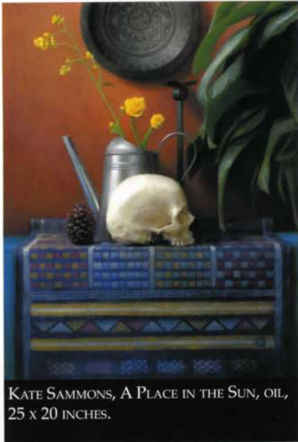
KATE SAMMONS, A PLACE IN THE SUN, OIL, 25 X 20 INCHES.

California-themed "Paint/Sculpt-Out," a fun-filled day for families to watch artists at work.