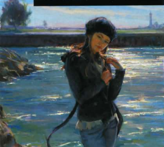
DAN GERHARTZ, ON THE EDGE, OIL, 30 X 40 INCHES.

Admission to the exhibition is included with museum admission, which is $10 for adults, $6 for students and seniors, $4 for children ages 3 to 12, and free for Autry members, veterans, and children age 2 and under. Admission is free on the second Tuesday of every month. The Autry is located at 4700 Western Heritage Way in Los Angeles with hours of operation 10:00 a.m. to 4:00 p.m. Tuesday through Friday and 10:00 a.m. to 5:00 p.m. on weekends. ♣