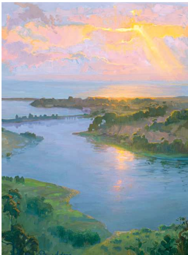
EASTERN LIGHT AFTER THE STORM