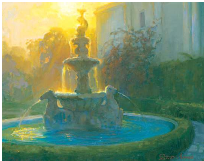
NEPTUNE'S FOUNTAIN AT SUNSET HUNTINGTON GARDENS, SAN MARINO, CALIFORNIA