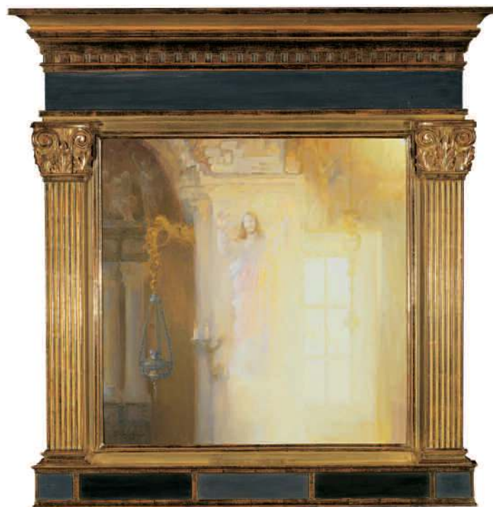
LIGHT OF ORNAVASSO , 1998 OIL ON BOARD, 30 X 30 IN.

of teaching was very much like that of the 19th-century French academies. For the first two years of study, I drew from plaster casts and worked in a full range of black and white values. Later, I painted still lifes under varying lighting effects. To make it more challenging, Mr. Lukits would often project different colored lights on a set-up that might include a complex variety of objects and textures, such as statuettes, mirrors, silks and brass. Sometimes the set-up would be covered by a gauze fabric to create a sense of haze or to soften an illusion. This type of training helped me to interpret outdoor light and atmosphere."