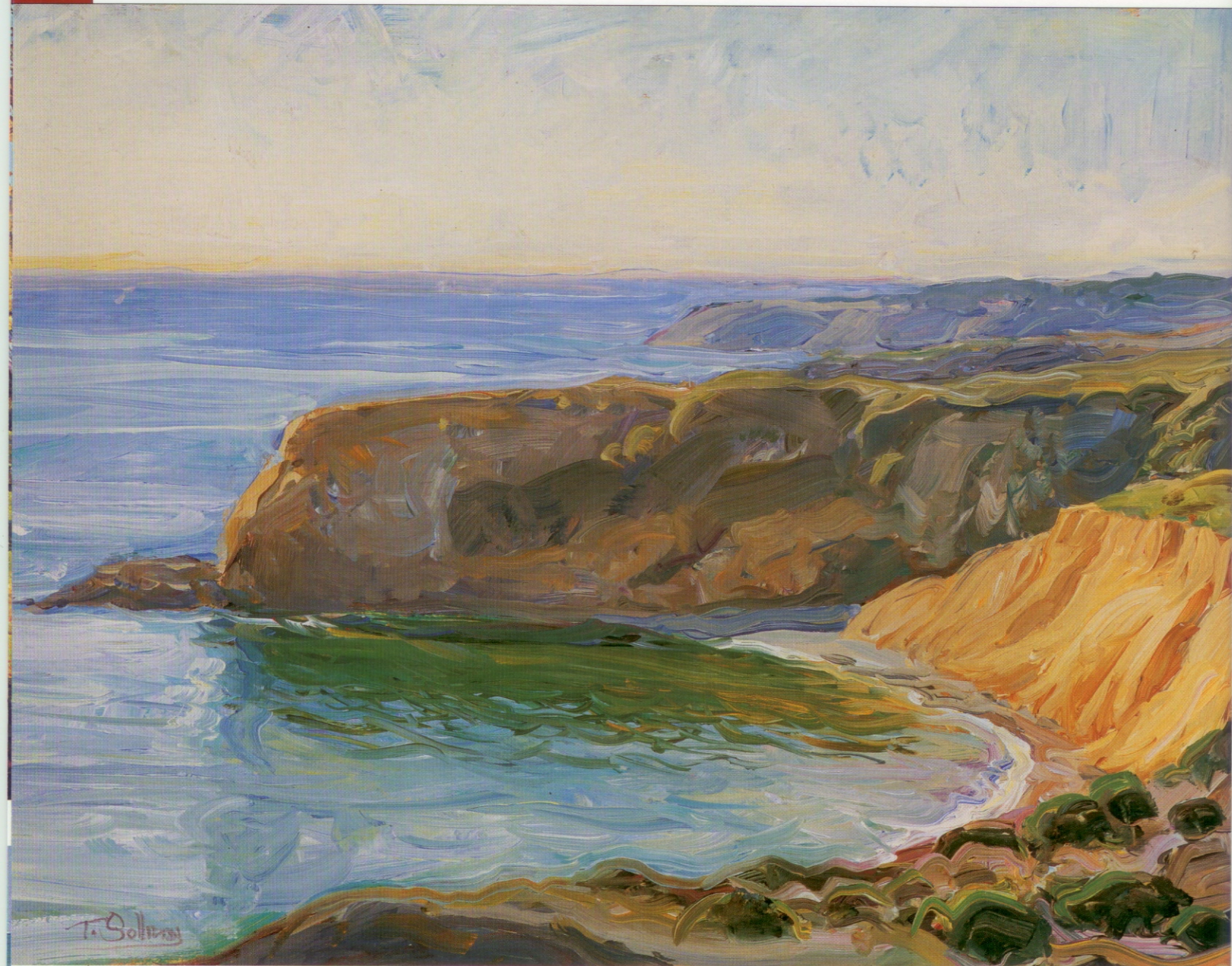
AFTERNOON PORTUGUESE BEND, OIL, 14 X 18.

the “shock of the new”—paint drippings on canvas and silk-screened photographs of celebrities—never has impressed Solliday. Instead he is fond of quoting something he read once: In truth and beauty lay all great fine art.