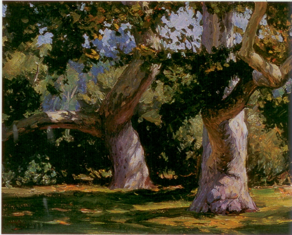
LAST OF THE LEAVES, OIL, 24 X 30.

Such philosophies of art also take a certain amount of patience and persistence. But these are