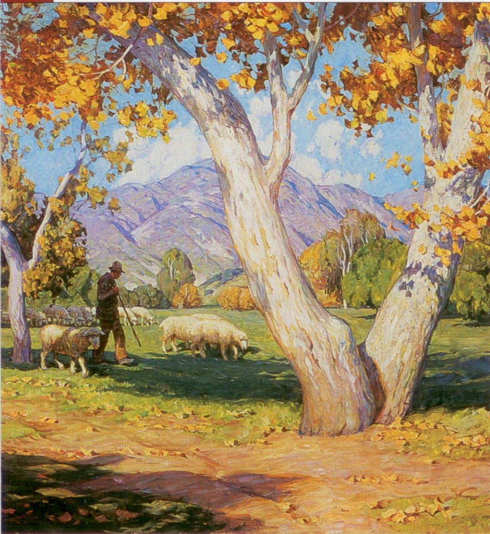
ABOVE: PASTORAL SYCAMORES, OIL, 40 X 36. BELOW: SAND, SEA, AND ROCKS, OIL, 20 X 24.