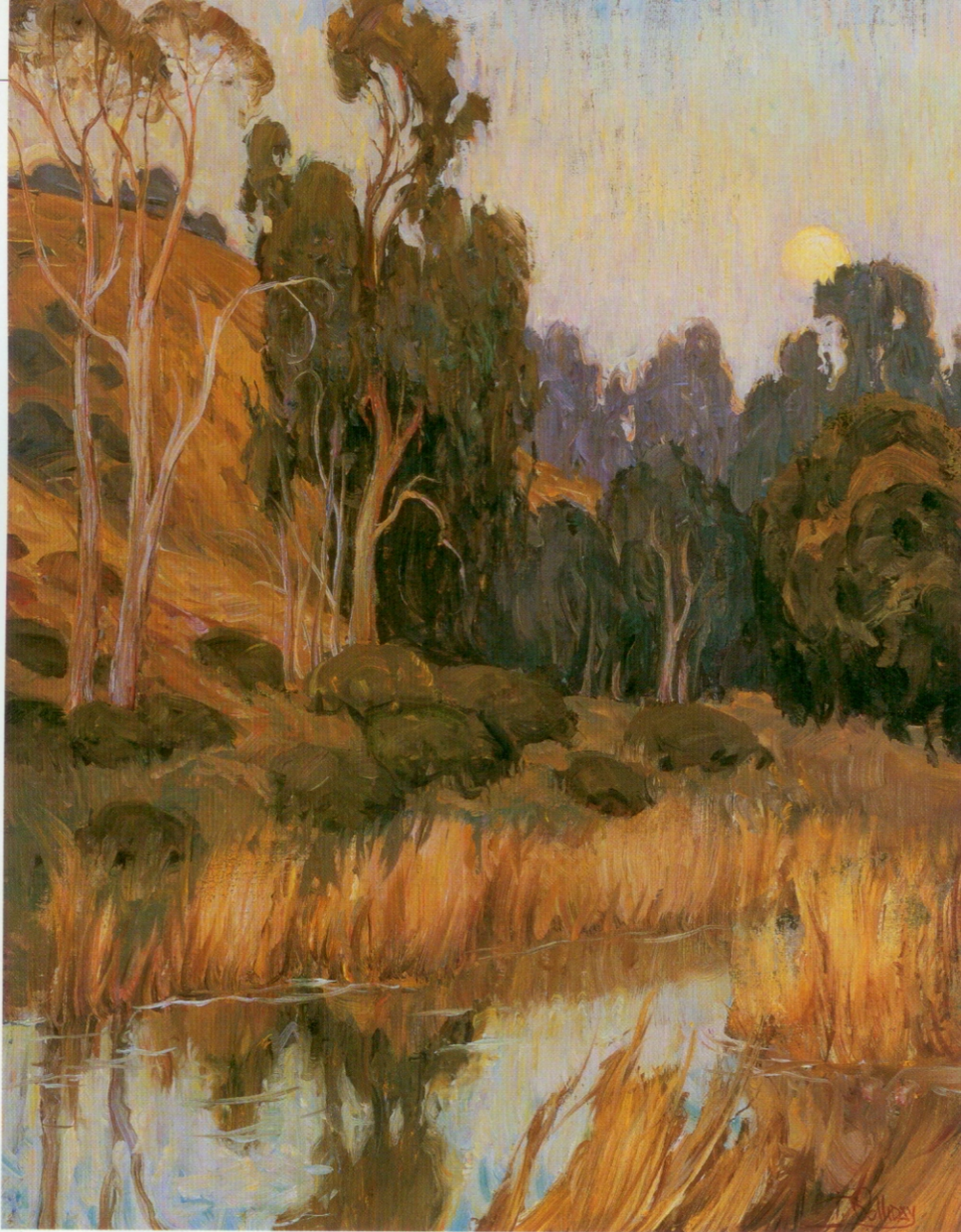
CANYON MOONRISE, OIL, 24 X 18.