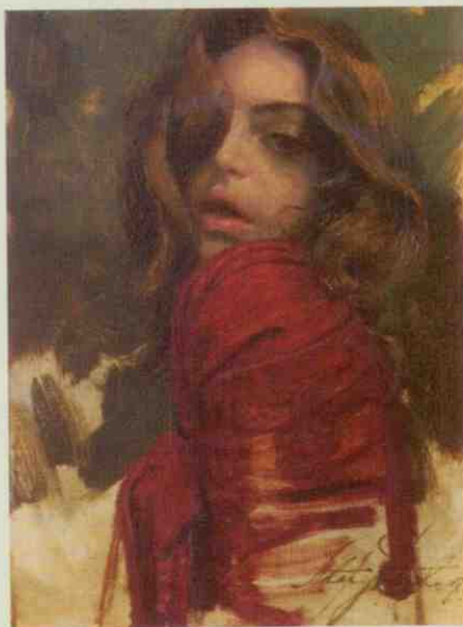
LEFT Red 2008, oil, 12 x 9. Private collection.