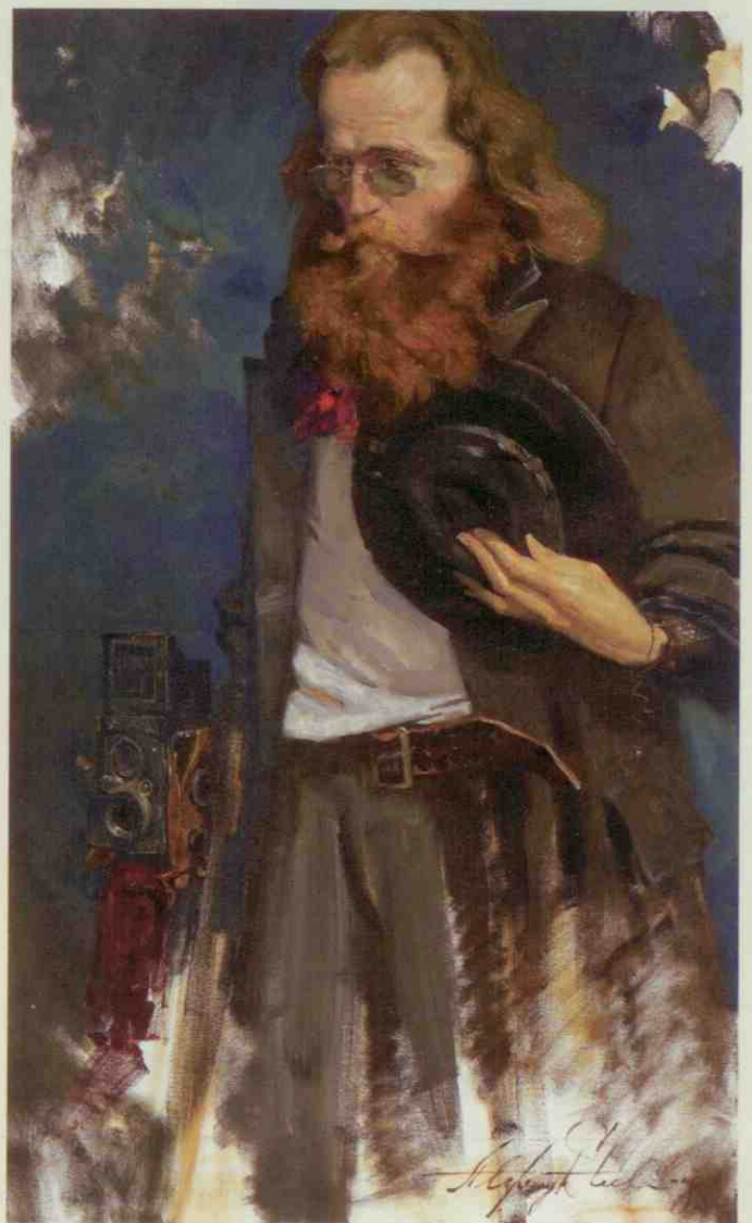
RIGHT Photographer: Lemuel 2008, oil, 60 x 36. Collection the artist.