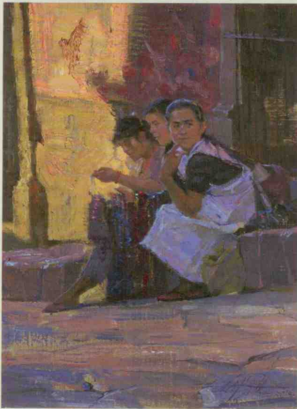
ABOVE Street Sellers, San Miguel de Allende 2010, oil, 16 x 12. Courtesy American Legacy Fine Arts, Pasadena, California.