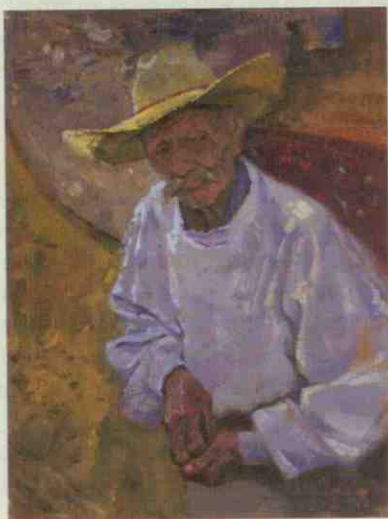
RIGHT Beggar, San Miguel de Allende 2010, oil, 16 x 12.