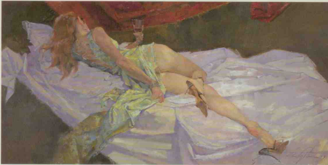
LEFT Romy 2009, oil, 30 x 60. Private collection.