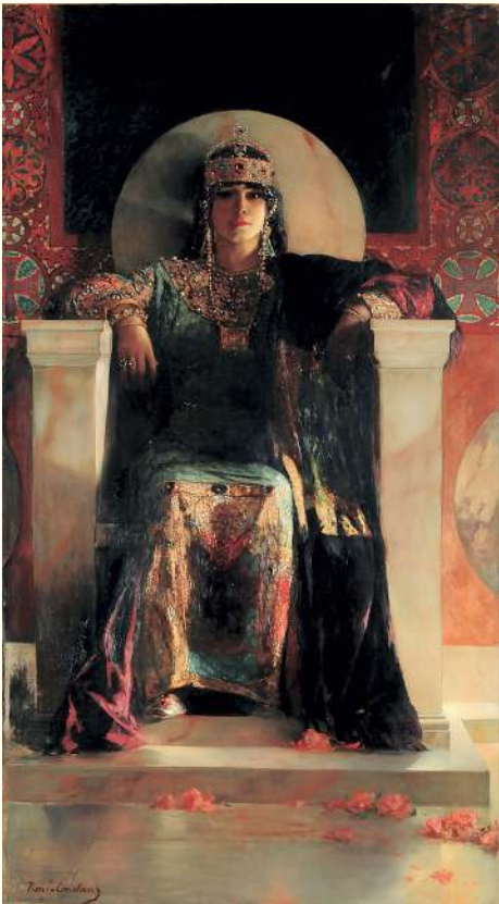
The Empress Theodora , 1887 Oil on canvas 88" × 49 1/2" Donated by Carlos Madariaga y Josefa Anchorena de Madariaga, 1911 inv. MNBA 2513

Benjamin-Constant was a man of good humour and laughter and was beloved by his students for his energy and positive attitude. He was industrious and temperate. His countenance was calm, expressive, and intellectual. Benjamin-Constant didn't smoke and he rarely drank. He hated laziness in his pupils, but was encouraging to even the most untalented that showed a desire to learn.