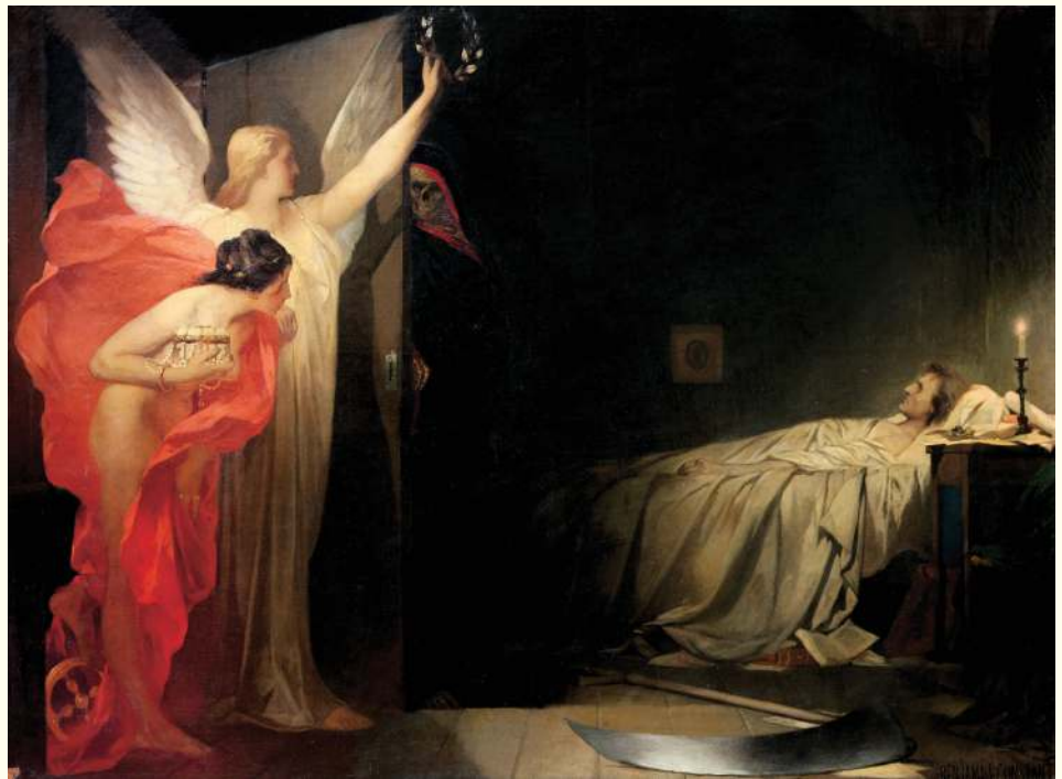
Too Late , 1870 Oil on canvas 51" × 69" Perpignan, Musée des Beaux-Arts Hyacinthe Rigaud

Throughout Benjamin-Constant's life, although he travelled extensively and maintained a house and studio in Paris, he always considered Toulouse his home town. He jokingly remarked about the great painter, Dominique Ingres (1780–1867) : "As for Ingres, how foolish to have been born in Montauban when he was so close to Toulouse."