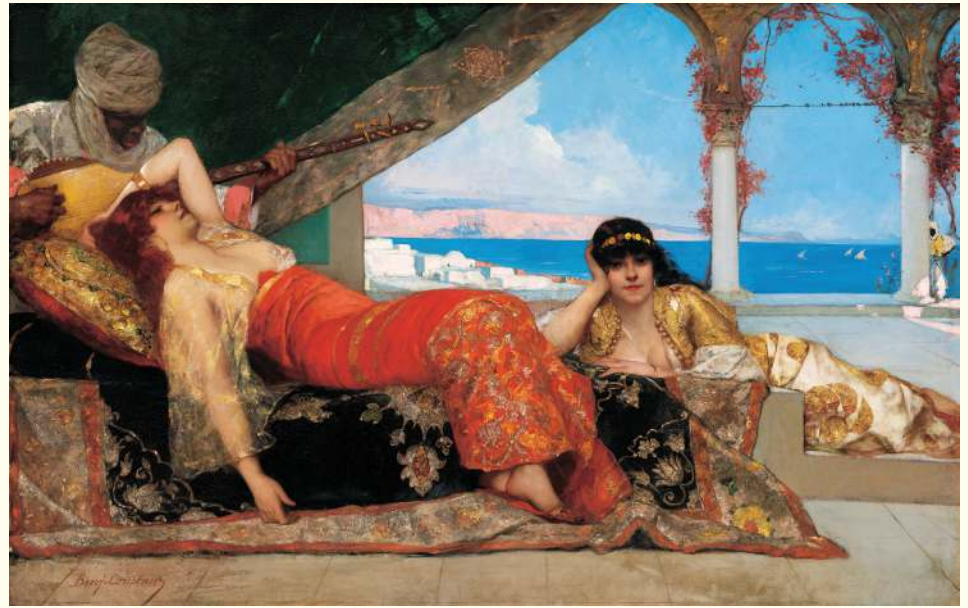
The Favourite of the Emir , c. 1879

The decade of the 1890s brought fame and fortune to Benjamin-Constant in an unexpected way, not as an Orientalist painter, but rather as a muralist and later as a portrait painter. As a muralist he received commissions to paint medallions and wall panels for the newly reconstructed University of Sorbonne in Paris, and ceilings and walls for the Hôtel de Ville , and the Opéra-Comique , also in Paris. In America he painted murals of Venetian and Byzantine subjects in the Frederick Ames Mansion in Boston. But closer to his heart was the work that he did in his home town of Toulouse where he painted murals in much of the interior of the City Hall, known as the Capitole . His most ambitious and controversial work there was the large mural, Entry of