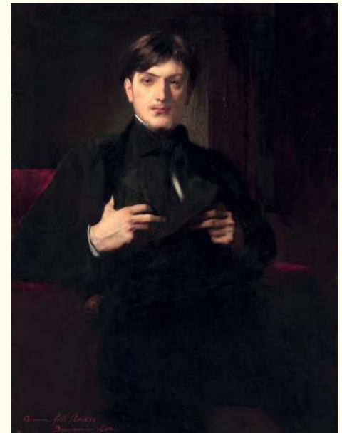
André Benjamin-Constant, 1895 Oil on canvas 46" × 34" Paris, Musée de Orsay inv. R.F. 104