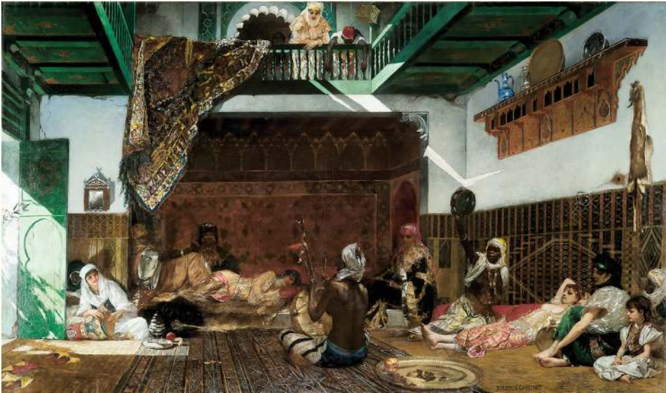
Interior of a Harem in Morocco , 1878