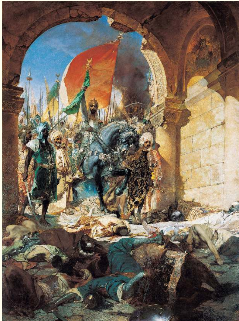
Entry of the Sultan Mehmed II into Constantinople on May, 1453, 1876 Oil on canvas 274" × 211"

Benjamin-Constant loved the Midi-Pyrénées city of Toulouse and retained its distinctive local “Midi” accent all his life. He was an integral part of the community and had