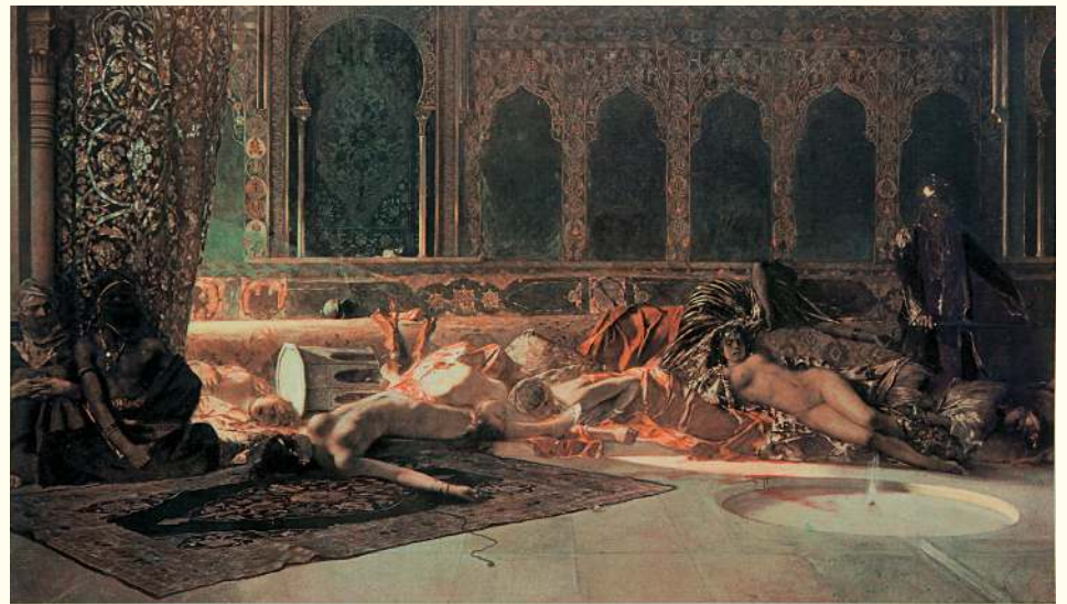
Sharif's Justice - Moorish Spain , 1885