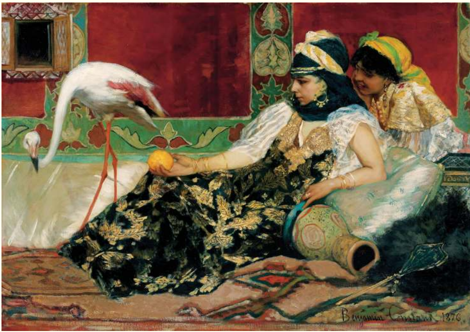
The Pink Flamingo , 1876