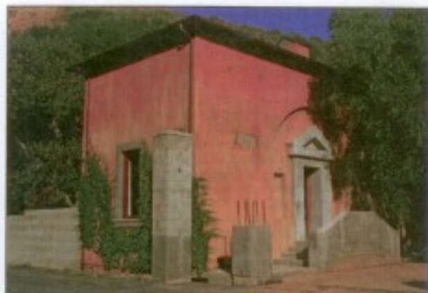
The Pinkham residence today.