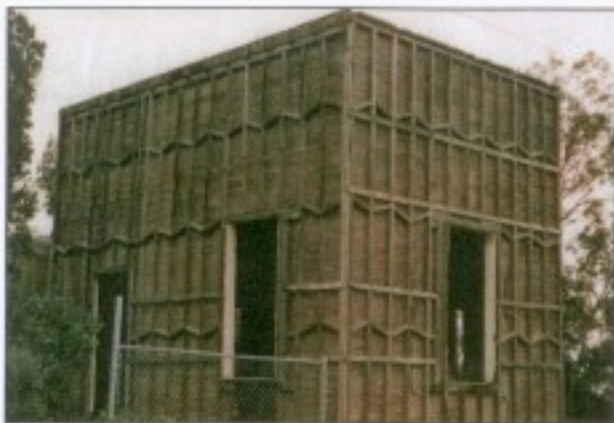
The Pinkham residence when they purchased it in May, 1998.