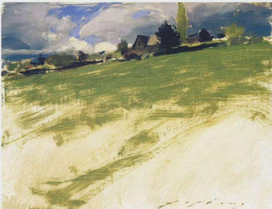
LA ROCHE POSAY, OIL ON CANVAS, 8 X 10"