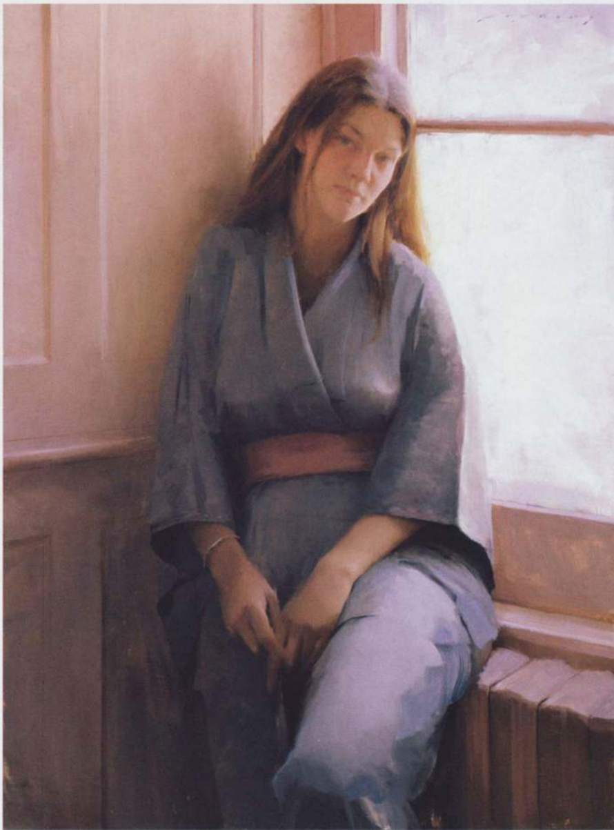
SELENE, OIL ON CANVAS, 40 X 30"