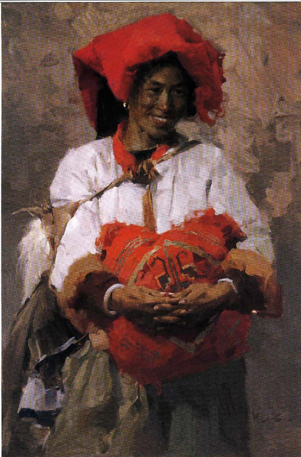
A JOYFUL MOMENT OIL, 30 x 20 IN.