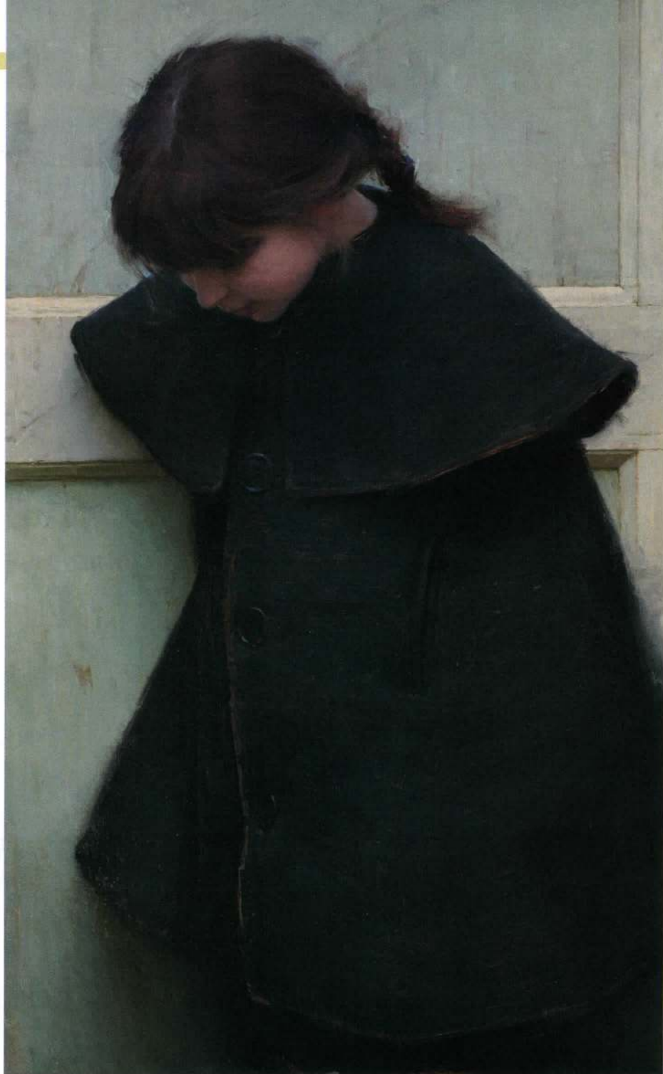
Skylar in Black, oil, 36 x 22.

How do you think you have helped contribute to a revival of interest in traditional art in California? Maybe I have inspired some-