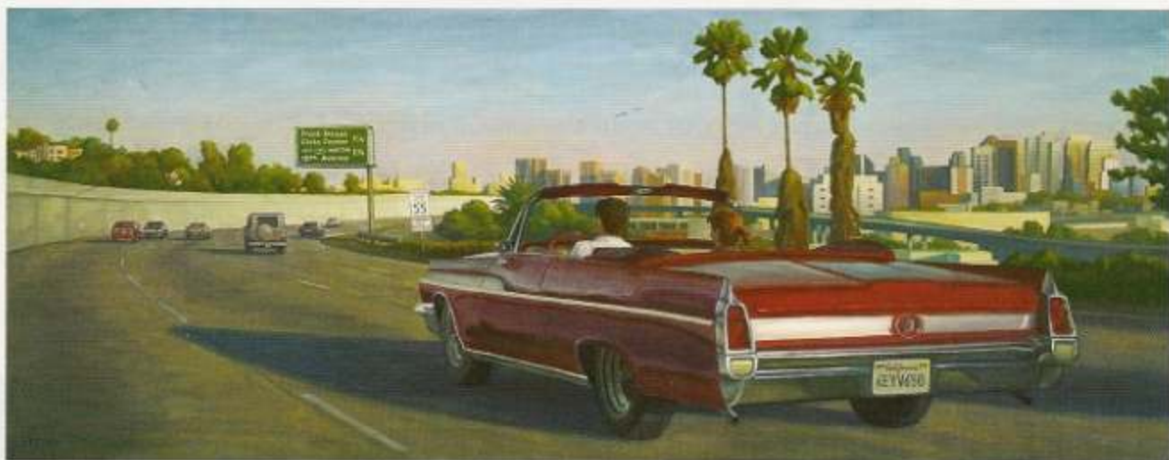
BUICK CONVERTIBLE, SAN DIEGO FREEWAY, OIL ON CANVAS, 16 X 41"