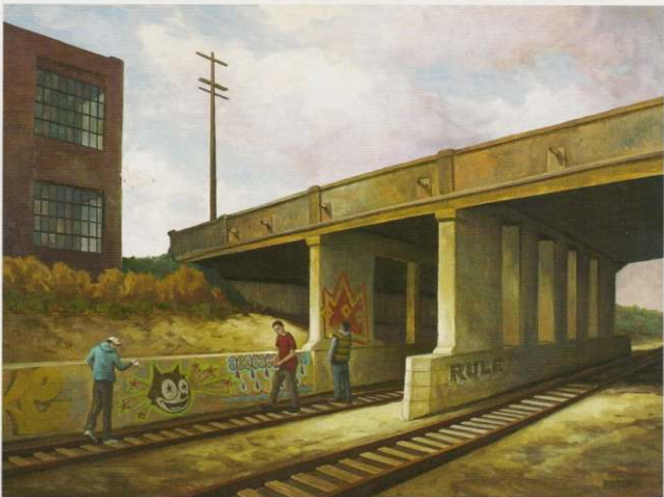
GRAFFITI BRIDGE, OIL ON CANVAS, 18 X 24"