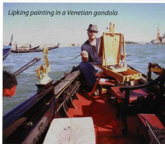
Lipking painting in a Venetian gondola