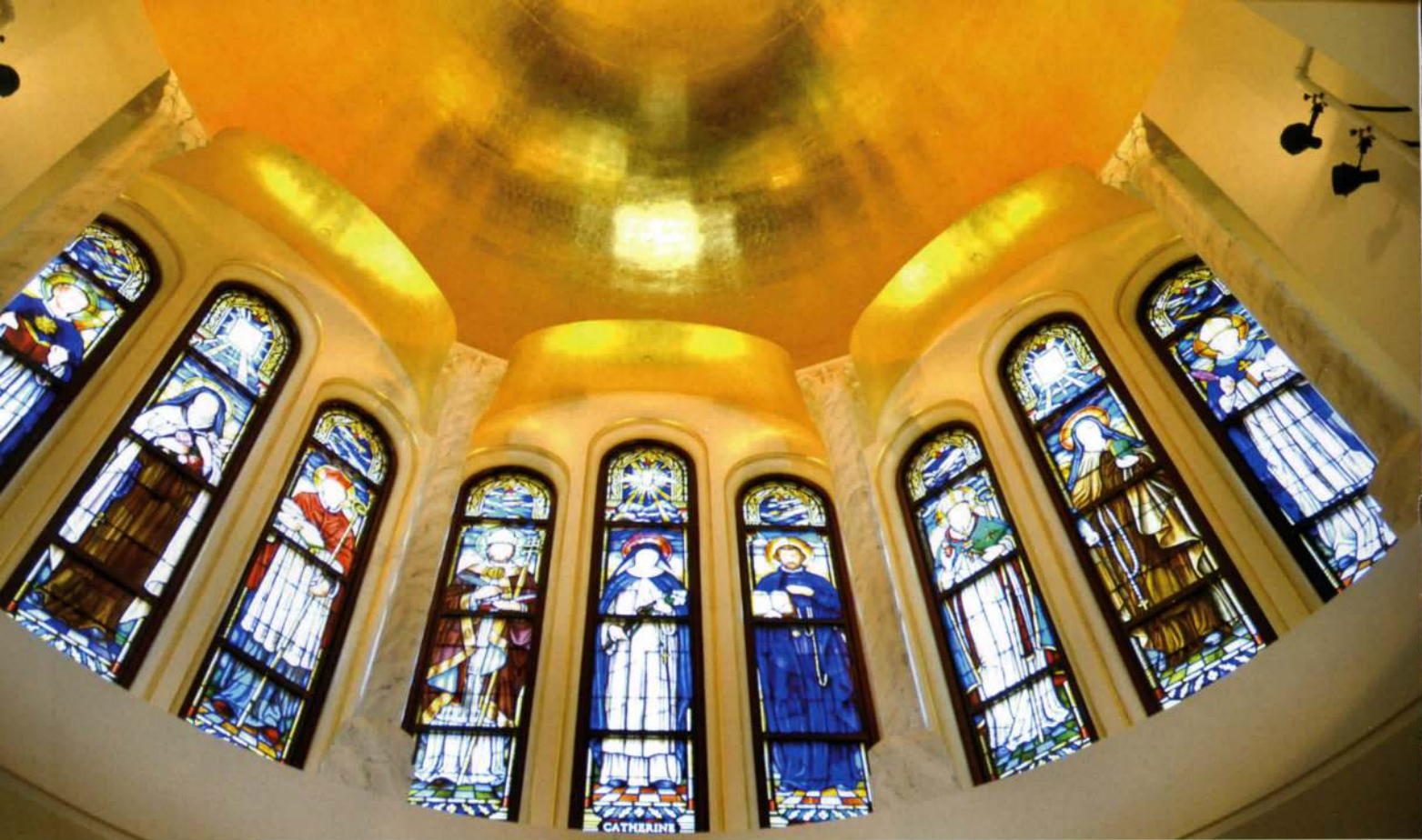
Above the tabernacle is the gold-leaf dome with nine of the 33 doctors of the church in stained glass by Judson Studios of Los Angeles.