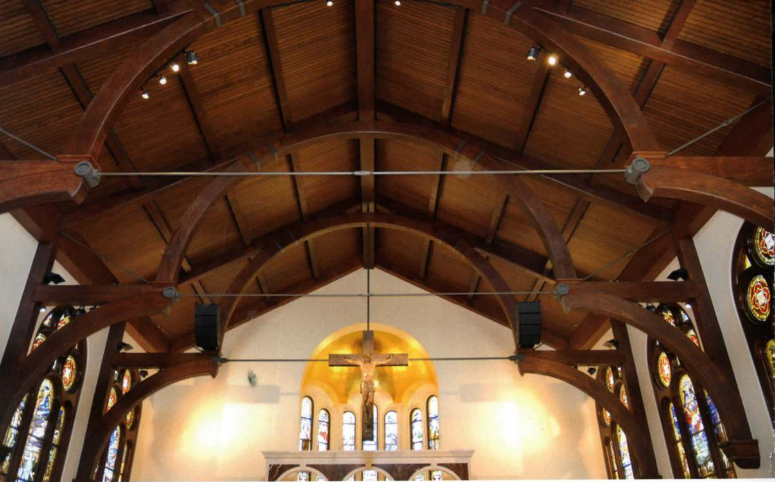
The open beam arched ceilings convey a wide selection of rich woods.

Other supporters hope the complex will become a religious and architectural landmark for the school and neighborhood.