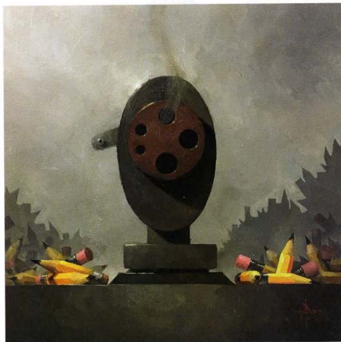
Select-Fire, oil, 8 x 8.

Representation: Abend Gallery, Denver, CO; Canary Gallery, Birmingham, AL.