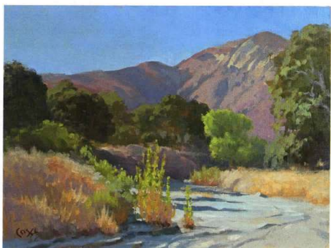
1 American Legacy Fine Arts is a private gallery specializing in contemporary painters and sculptors.