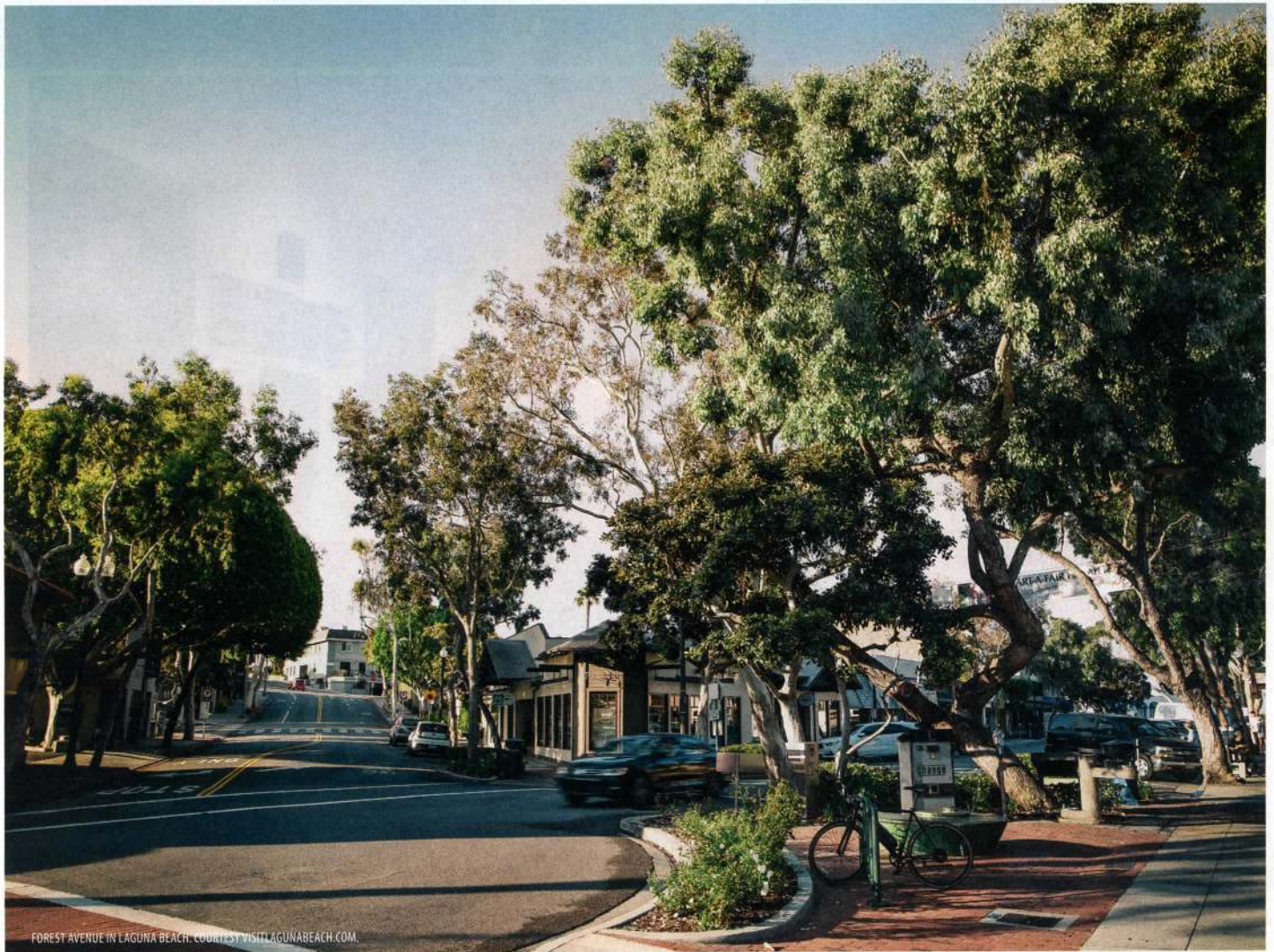
FOREST AVENUE IN LAGUNA BEACH.

October 5 to 13 at the Festival of Arts pavilion. For the event, around 50 plein air painters set up their easels around the town and then showcase and sell their works on-site. On October 12 there is a gala where awards will be doled out as part of the competition.