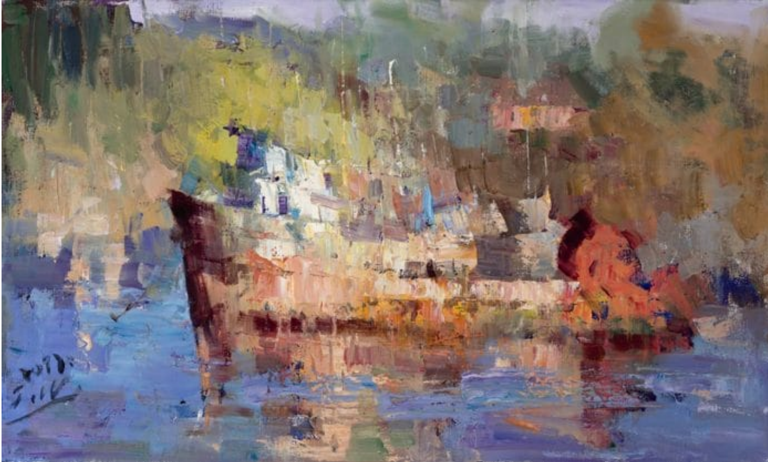
Jove Wang, "Sunset at Monterey Bay," oil on linen, 10 x 20 inches

American Legacy Fine Arts in Pasadena, California, recently opened a splendid exhibition of plein air works by some of the most collected and celebrated painters in the United States. Who's included? Find out here.