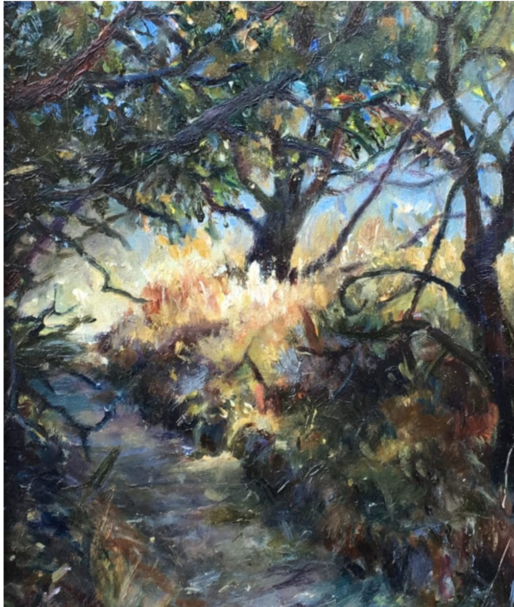
Nikita Budkov, "Forgotten Realms; Topanga Park," oil on aluminum, 7 x 5 inches

"With 'Fleeting Moments', American Legacy Fine Arts joins the discourse of defining plein air (outdoor) painting to include elements of light and its momentary effects; the relationship of juxtaposed colors; and brushwork that is loose, lively, broad, or impasto. Smaller