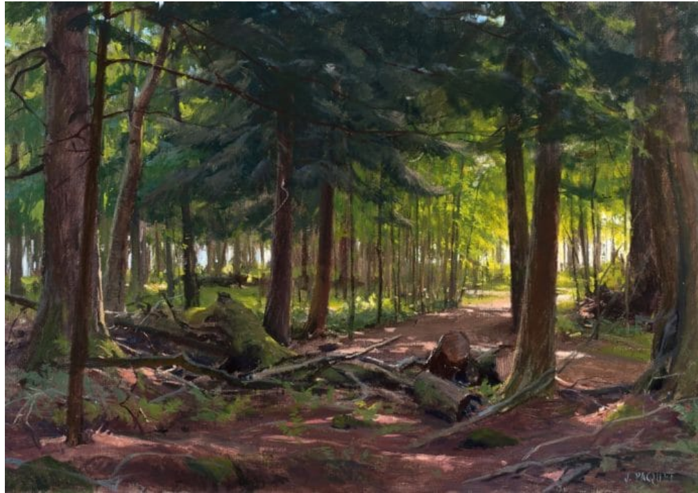
Joseph Paquet, "Ojibwe Sunrise," oil on canvas, 28 x 40 inches

works may be completed in its entirety out-of-doors, while large-scale plein air paintings may be done in the studio with the use of on-location studies and color notes taken in nature."