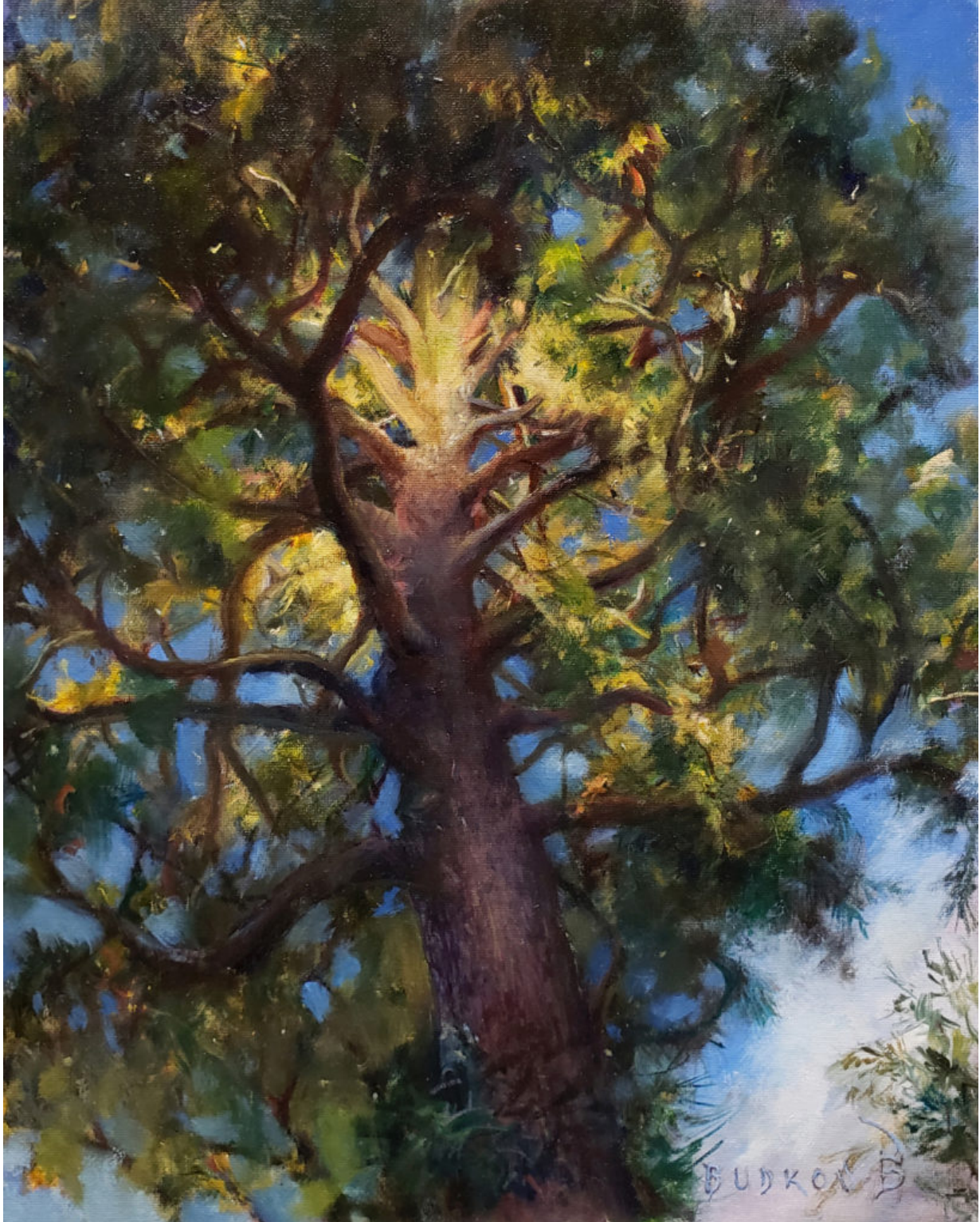
"Towards the Light," oil on canvas panel, 18 x 14 in.

Connect with Nikita Budkov: www.nikitabudkov.com