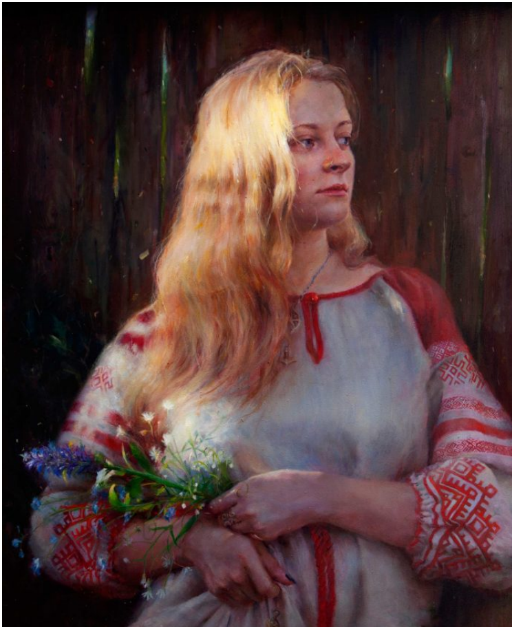
NIKITA BUDKOV (b. 1995), East of the Sun , 2019, oil on panel, 40 x 30 in., available from the artist

There is a lot of superb contemporary realism being made these days; this article by Allison Malafronte shines light on a gifted individual.