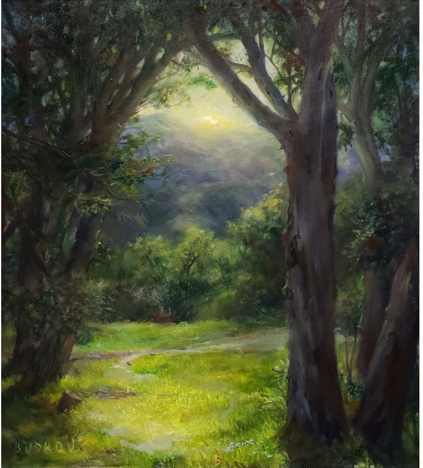
"Old Mornings Dawn, Paramount Ranch," oil on canvas panel, 24 x 20 in.