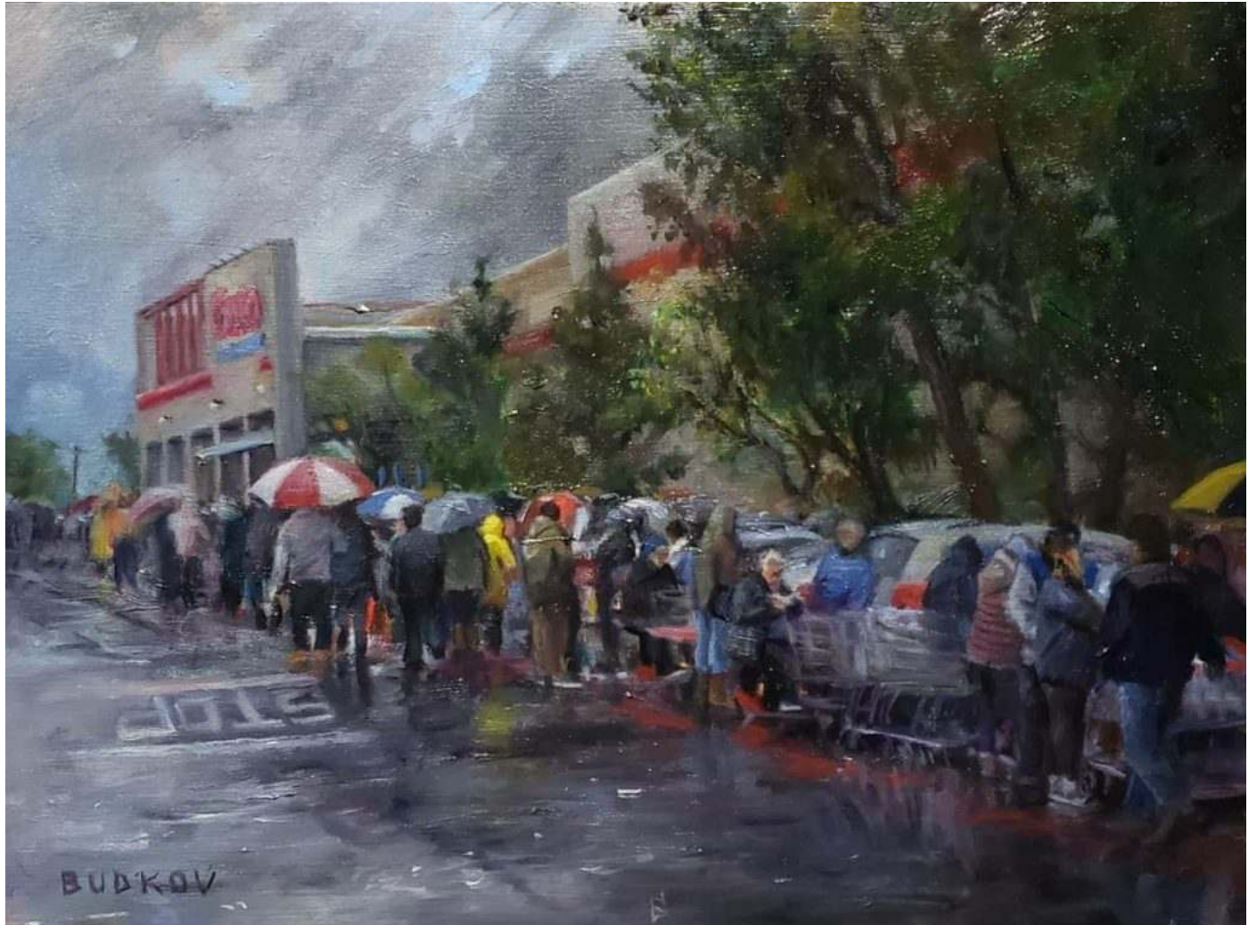
"Floods, March 2020," oil on wooden panel, 9 x 12 in. This painting is inspired by the current pandemic and symbolizes the long lines at grocery stores.