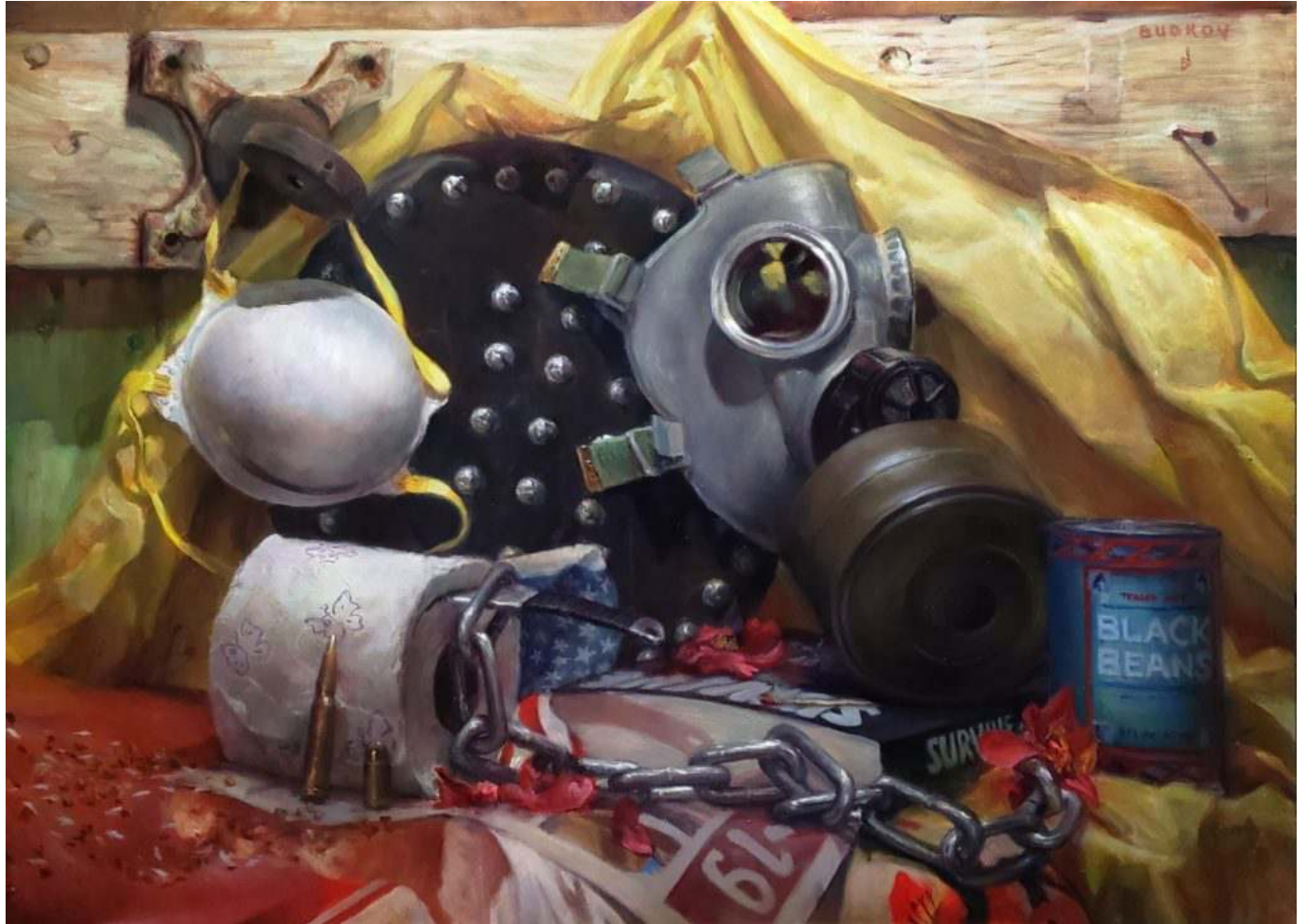
"Some Kind of Monster, COVID 19," oil on board, 18 x 24 in., showcases essential and not so objects