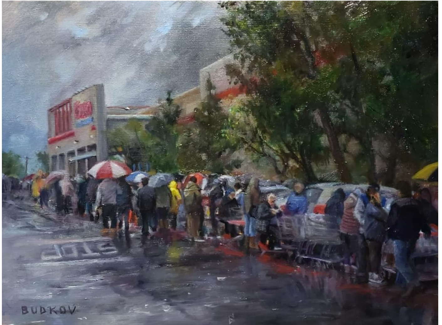
"Floods, March 2020," oil on wooden panel, 9 x 12 in. This painting is inspired by the current pandemic and symbolizes the long lines at grocery stores.