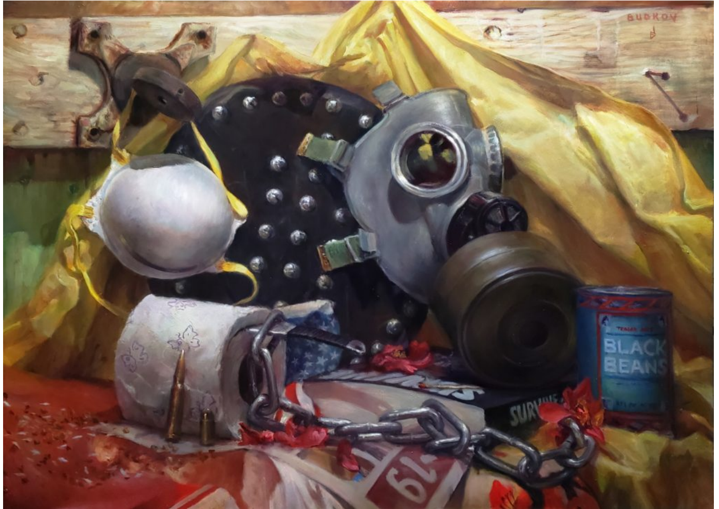
"Some Kind of Monster, COVID 19," oil on board, 18 x 24 in., showcases essential and not so objects