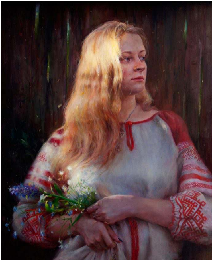
NIKITA BUDKOV (b. 1995), East of the Sun , 2019, oil on panel, 40 x 30 in., available from the artist

There is a lot of superb contemporary realism being made these days; this article by Allison Malafronte shines light on a gifted individual.