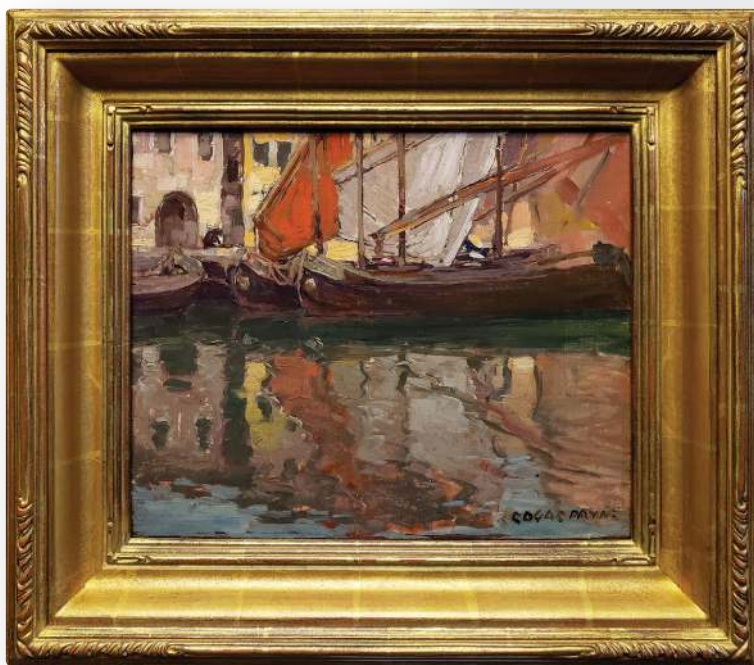
Edgar Alwin Payne (1883–1947) Untitled – Chioggia Boats , c. 1922–1924 Oil on canvas 12.5" × 14.5" Framed 17.75" × 20"