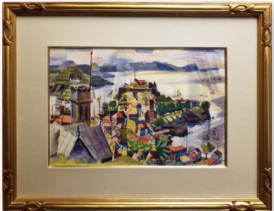
Phillip Herschel Paradise (1905–1997) Port , 1949 Watercolor 14.5" × 20.75" Framed 25" × 32"