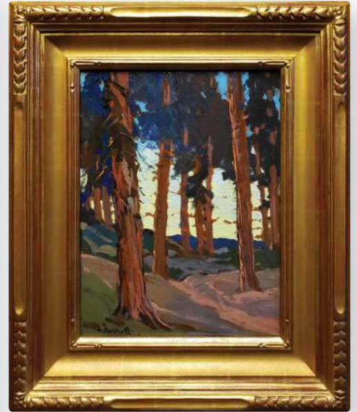
Hanson Duvall Puthuff (1875–1972) Mountain Pines, c. 1930s Oil on panel 16" × 12" Framed 23" × 19"