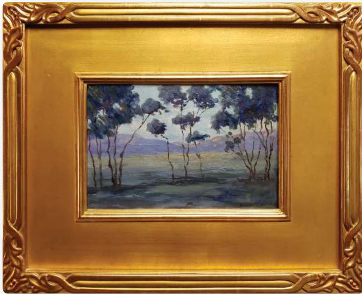
John Marshall Gamble (1863–1957) Untitled – Eucalyptes Landscape , c. 1920s Oil on wood panel 6.125" × 9.25" Framed 13.38" × 16.5"