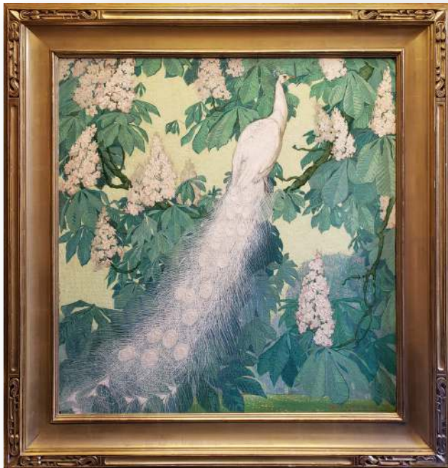
Jessie Hazel Arms Botke (1883–1971) White Peacock – Spring , c. 1930 Oil on canvas masonite panel 31.125" × 29.5" Framed 40" × 38.5"