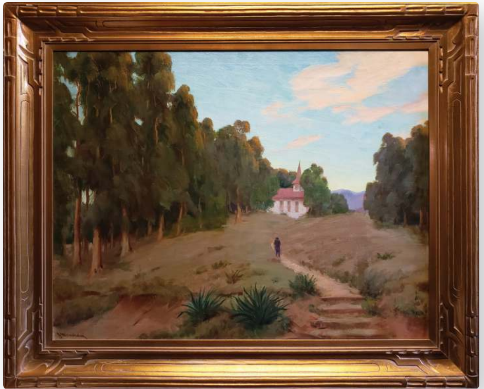
Jean Mannheim (1863–1945) Pathway to the Church , c. 1915 Oil on canvas 28.25" × 36.5" Framed 37" x 45"