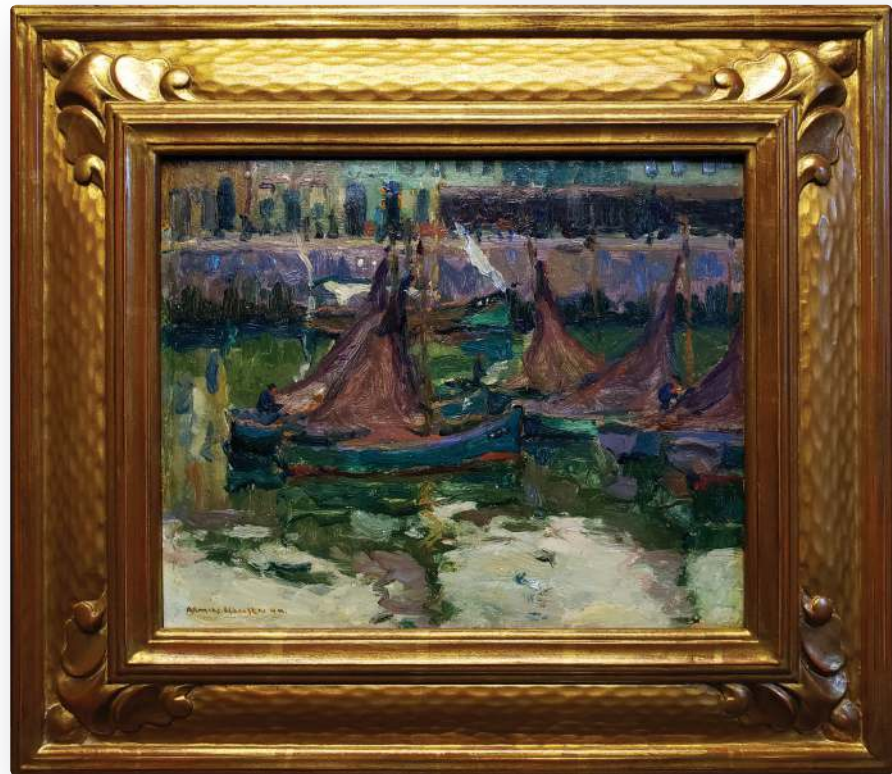
Armin Carl Hansen (1886–1957) Idle Fisher Fleet , c. 1912 Oil on panel 10" × 12.125" Framed 16.38" × 18.75"