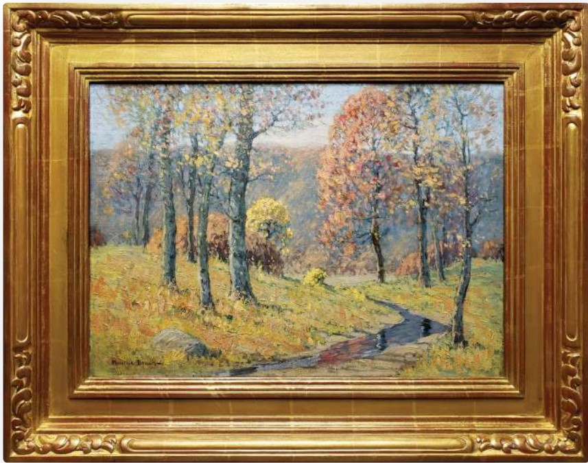
Maurice Braun (1877–1941) Autumn Colors , c. 1920s Oil on canvas 16" × 22" Framed 23" × 29"