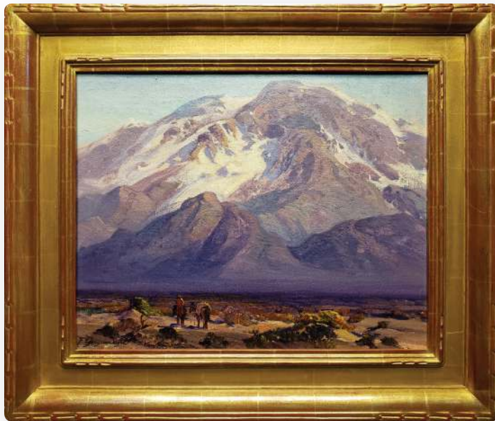
Fred Grayson Sayre (1879–1939) Untitled – Western Landscape, Owens Valley, c. 1925 Oil on canvas 16" × 20" Framed 22.5" × 26.5"