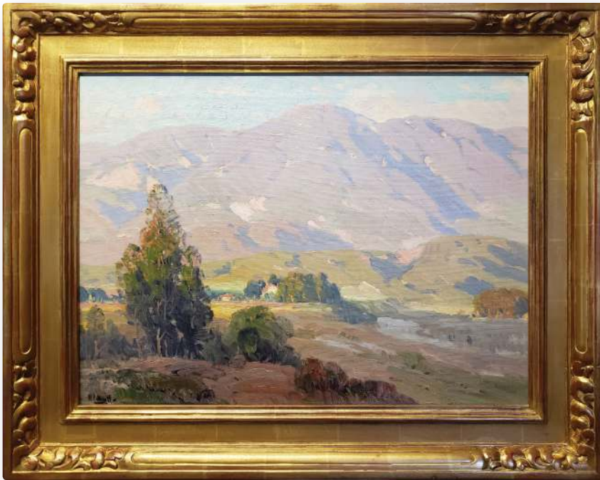
Hanson Duvall Puthuff (1875–1972) Near La Cañada, c. 1930 Oil on canvas 18" × 24" Framed 25" × 30.5"