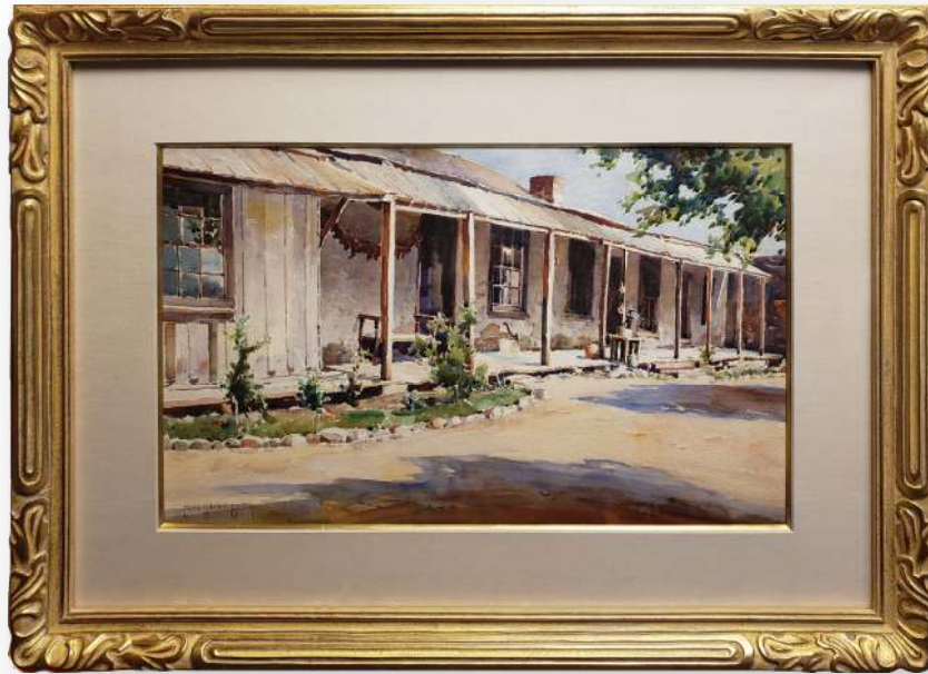
Carl Oscar Borg (1879–1947) The Hacienda , c. 1921 Watercolor 14.25" × 21.75" Framed 25" × 34"