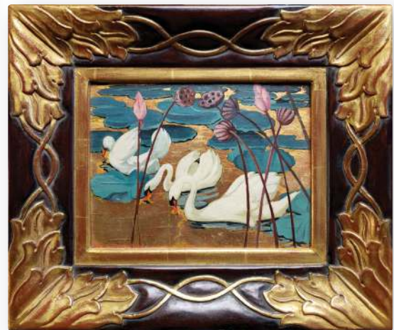
Jessie Hazel Arms Botke (1883–1971) Untitled – Three Swans , c. 1920–1930 Oil on panel with gold leaf 6.875" × 9" Framed 12" × 14.5"