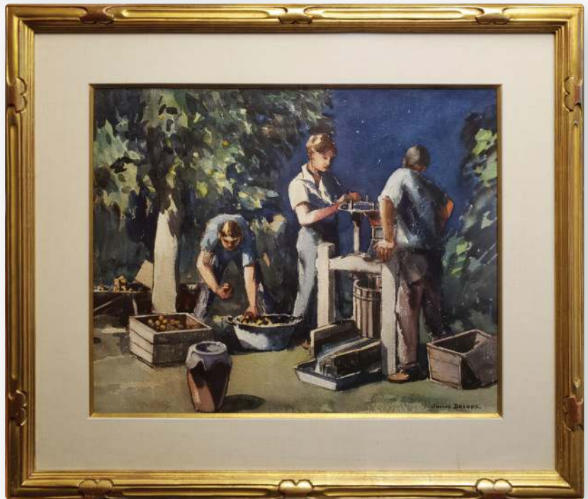
Julius Maxmillon Delbos Untitled – Fruit Pickers , c. 1930s Oil on canvas 16" × 22" Framed 19.5" × 24.25"