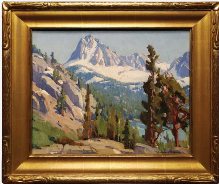
Marion Ida Kavanagh Wachtel (1876–1954) Untitled (Snow-capped Mountains) – Grand Teton National Park, c. 1930s Oil on panel 15.75" × 19.25" Framed 20.75" × 24.5"