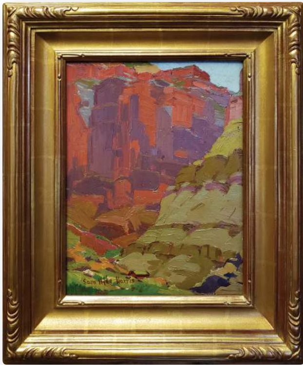
Sam Hyde Harris (1889–1977) Canyon Walls , c. 1920s Oil on canvas panel 16" × 12" Framed 22" × 18"