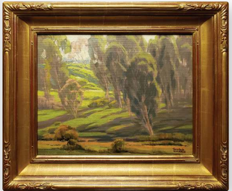
Sam Hyde Harris (1889–1977) Arroyo Grove , c. 1940s Oil on panel 16" × 20" Framed 24" × 34"