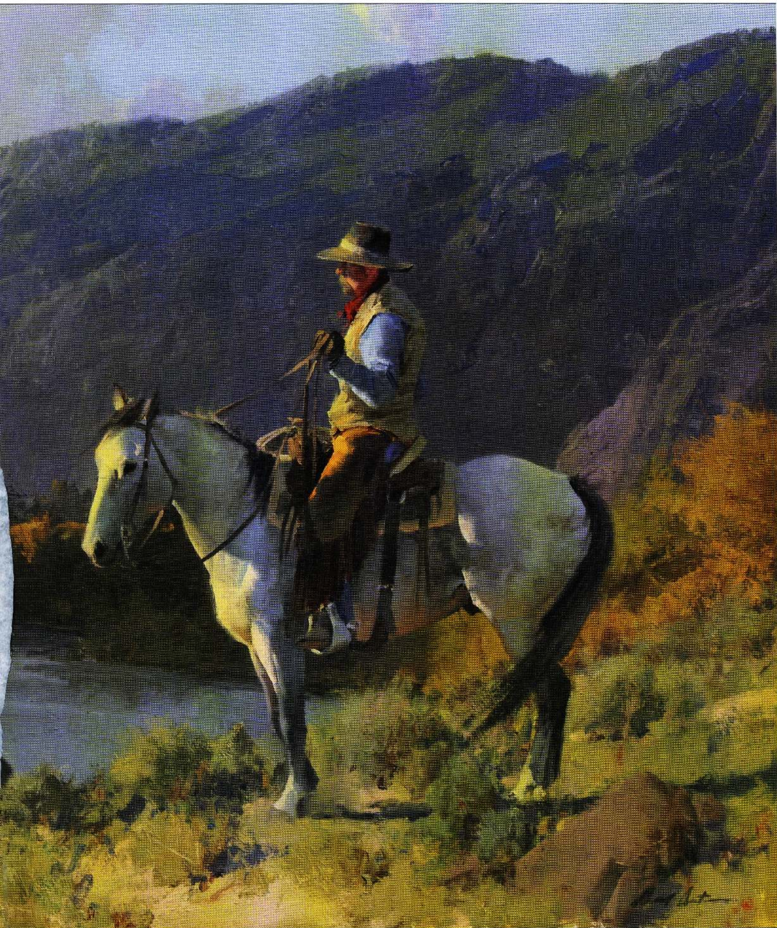
River Canyon Gather , oil, 28 by 40"

Water is the life blood of the West whether caught and held in dirt tanks or running in streams and canyons. Sunlit figures in bold relief against dramatic canyon walls and receding ridges affords the opportunity to explore atmospheric perspective."