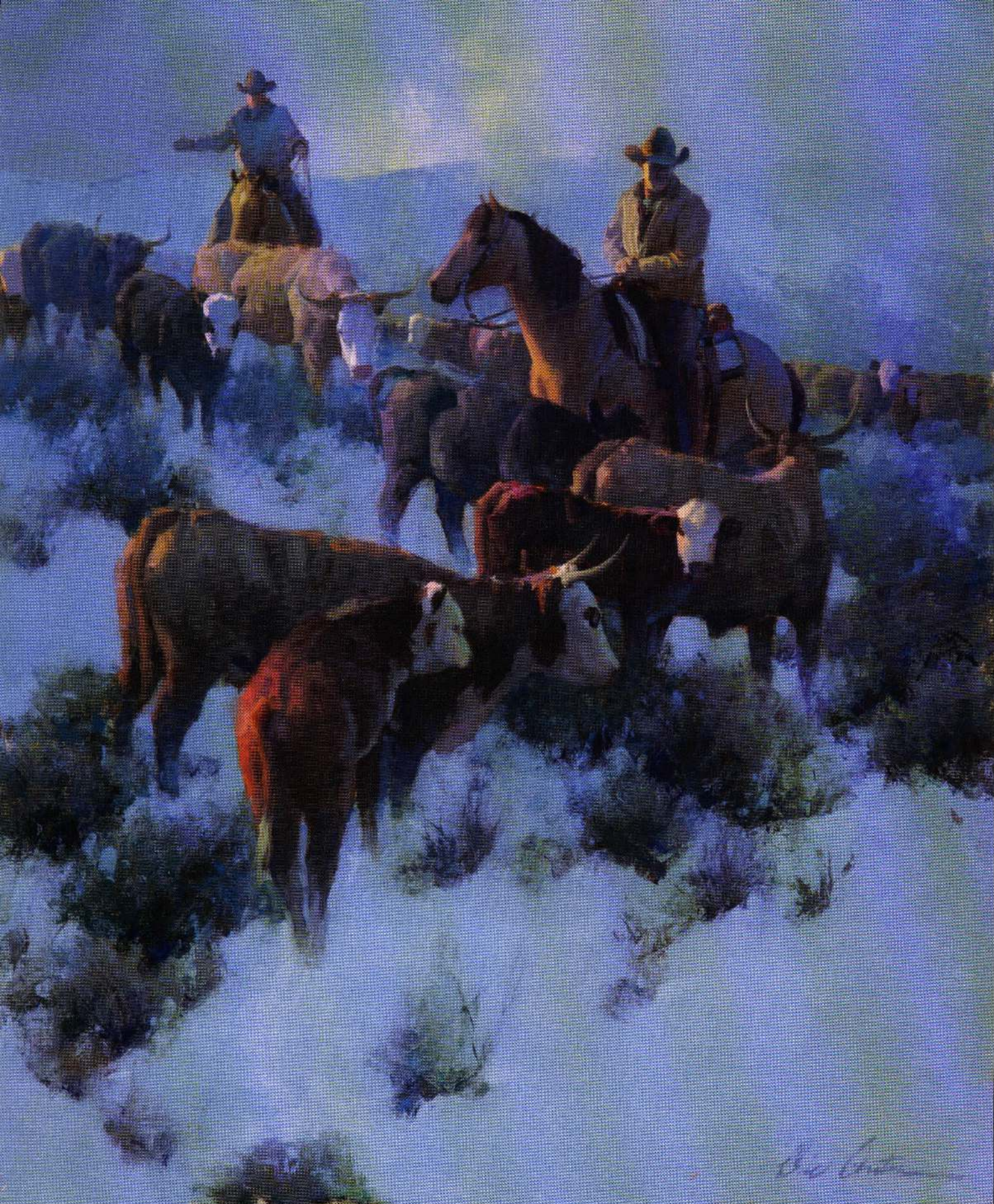
Winter Palette, oil, 30" by 24"

"Warm and cool, sun-struck and shadow, and the added interest of multi-level figure placement made for a fun composition. I am always interested in that very warm, low light that creeps beneath cloud cover and momentarily lights up figures."