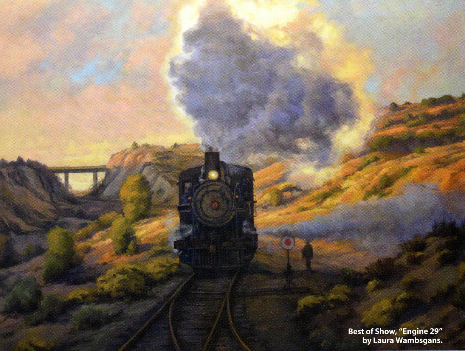
Best of Show, "Engine 29" by Laura Wambsgans.